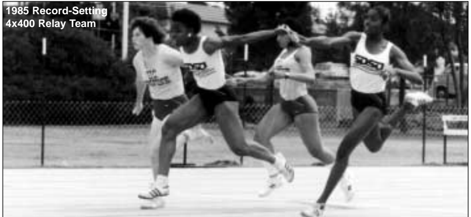
1985 Record-Setting 4x400 Relay Team