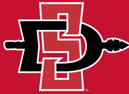
SAN DIEGO STATE AZTECS