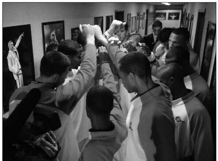
San Diego State earned a trip to Madison Square Garden in New York City after it swept through the first three rounds of the NIT to advance to the semifinals where it met Baylor.

Steve Fisher-coached San Diego State team recorded 20 or more wins. The 26 wins in 2008-09 is the highest total SDSU has reached under Fisher in his 10 seasons on Montezuma Mesa.