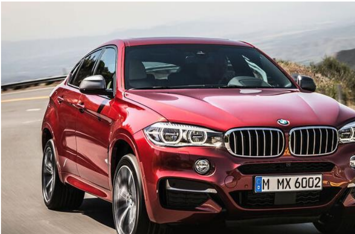
Tax per year: 266 €