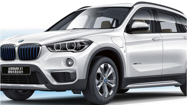
Tax per year: 104 €

Principal of taxation: Owners pay damage on the environment (Federal tax). The taxation depends on different topics like type of vehicle engine and cubic capacity etc.