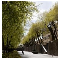
DTU Copenhagen Denmark