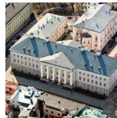
University of Tartu Tartu Estonia