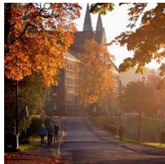
NTNU Trondheim Norway