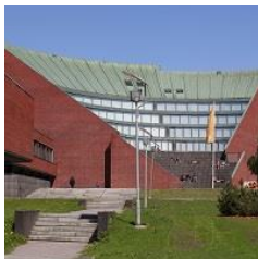
Aalto University Helsinki/Espoo Finland