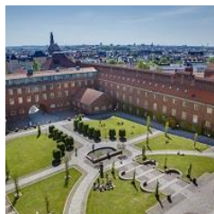
KTH Stockholm Sweden