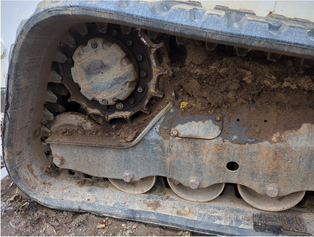
Right Track Condition / 03-05-2024