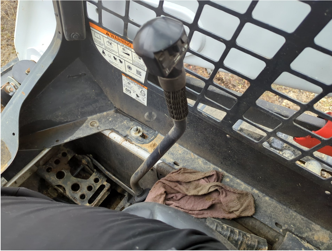
Switches and Controls / Travel Control / 03-05-2024