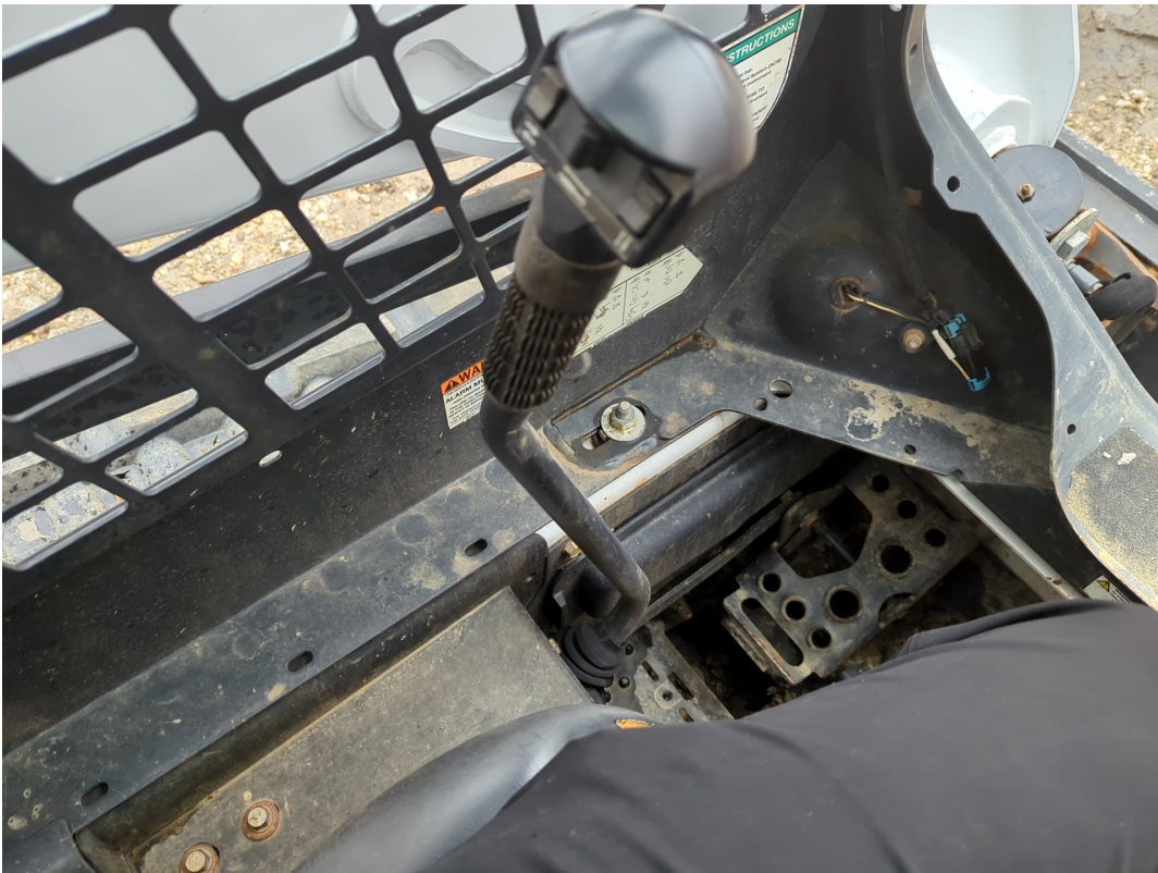
Switches and Controls / Travel Control / 03-05-2024