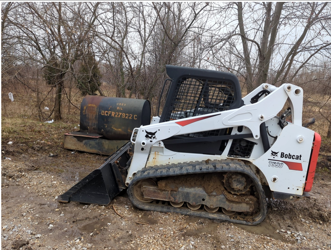
Left / 03-05-2024