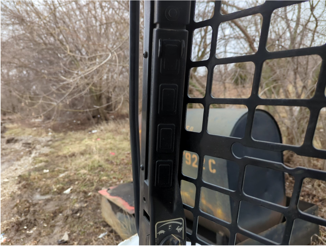
Switches and Controls / 03-05-2024