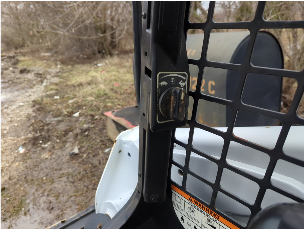
Switches and Controls / 03-05-2024