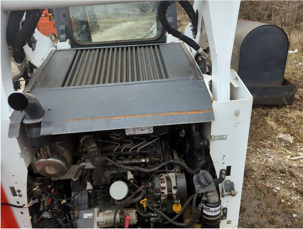
Engine Compartment / Exhaust / 03-05-2024