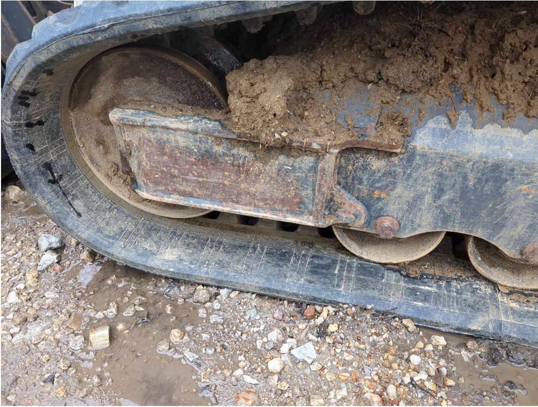
Left Track Condition / 03-05-2024