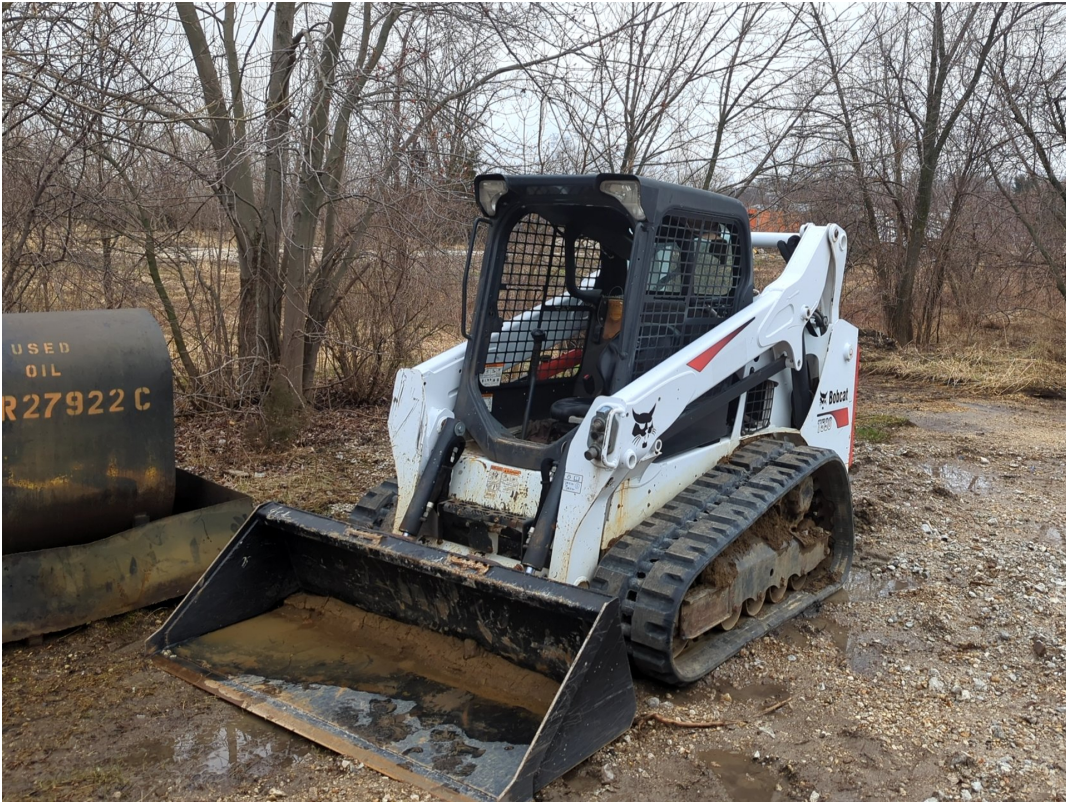
Front Left / Attachments - Bucket / 03-06-2024