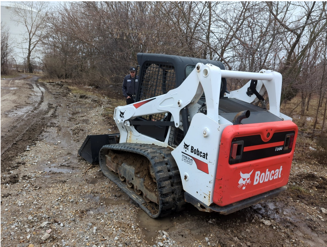
Rear Left / 03-05-2024