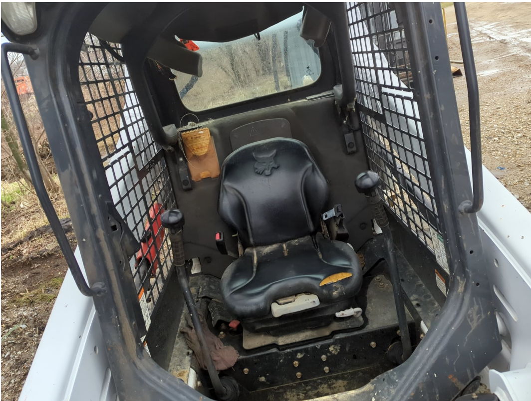
Interior Condition / ROPS / Handrails / Operator's Seat / 03-05-2024