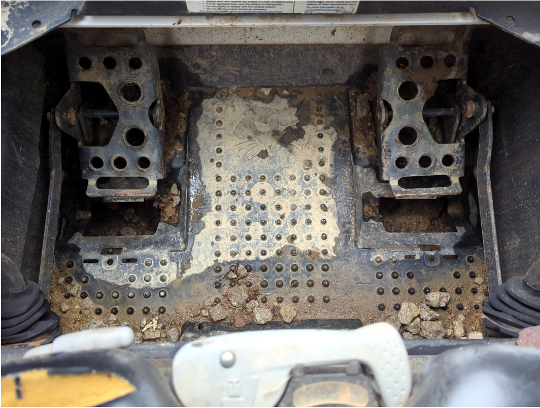
Floorboard / Pedals / 03-05-2024