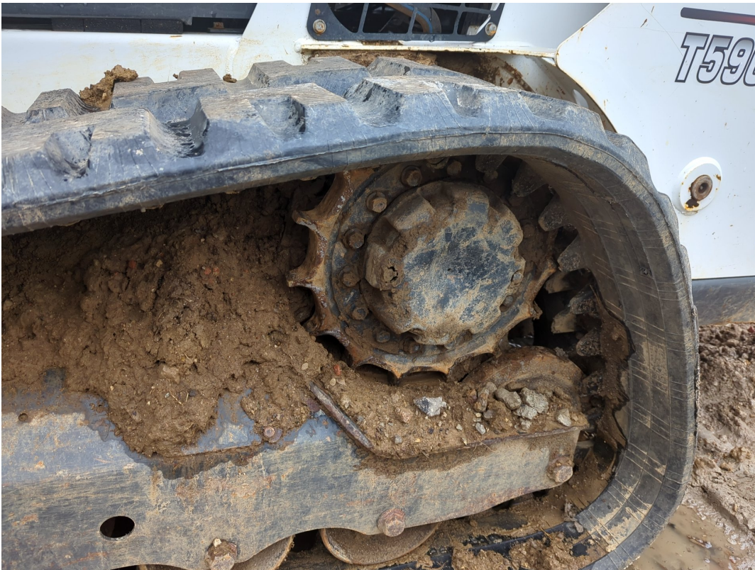
Left Track Condition / 03-05-2024