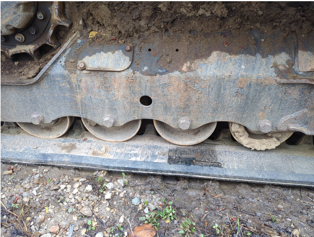
Right Track Condition / 03-05-2024