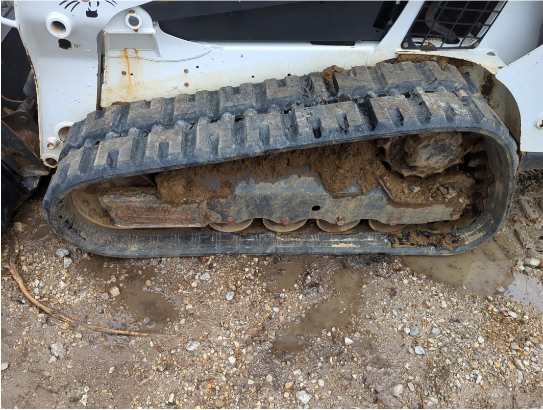
Left Track Condition / 03-05-2024