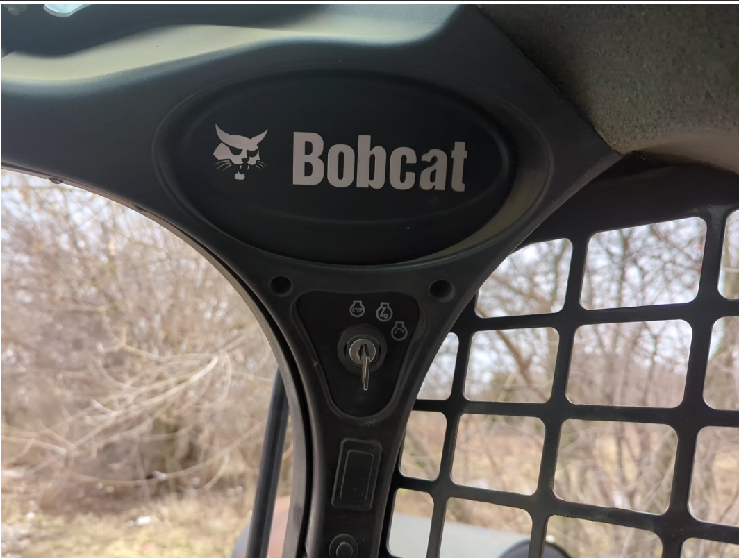
Switches and Controls / 03-05-2024