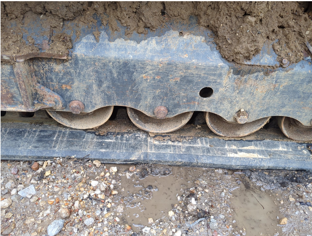
Left Track Condition / 03-05-2024