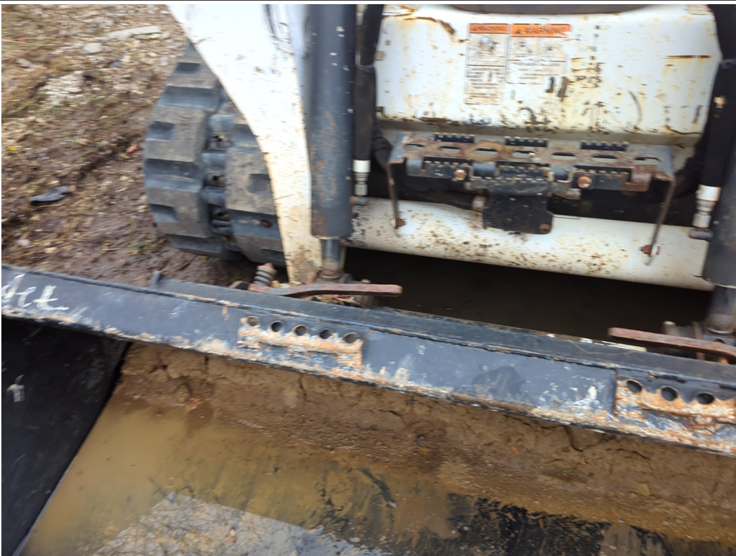
Steps / 03-05-2024