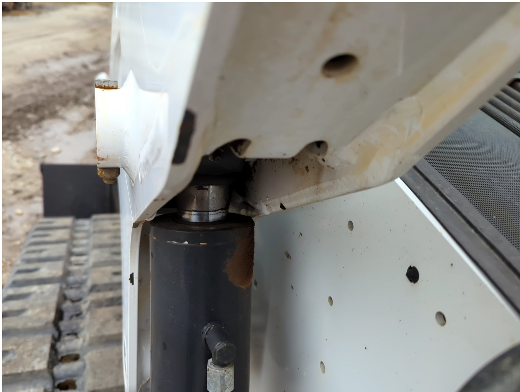
Cylinders / 03-05-2024