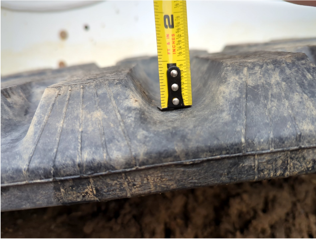
Left Track Tread Depth Measurement / 03-05-2024