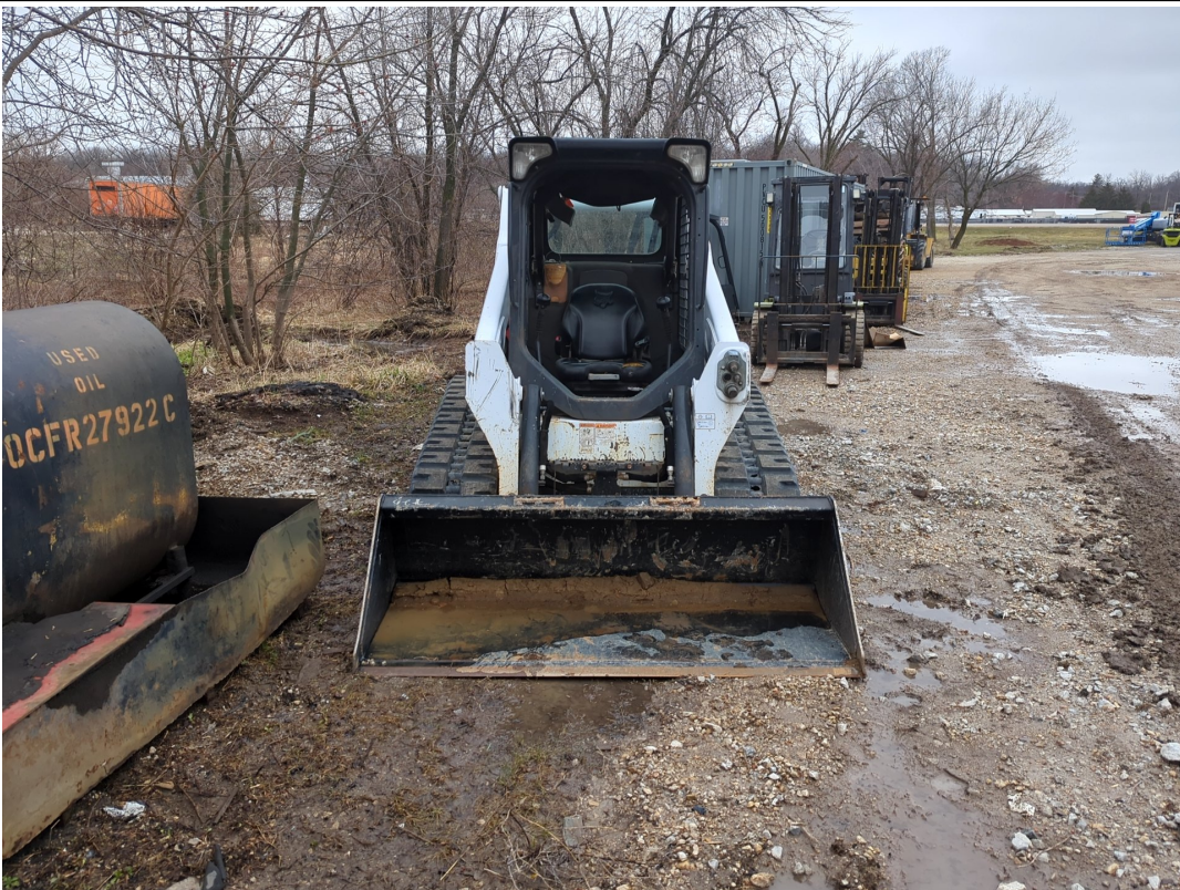
Front / Attachments - Bucket / Front Lights / 03-05-2024