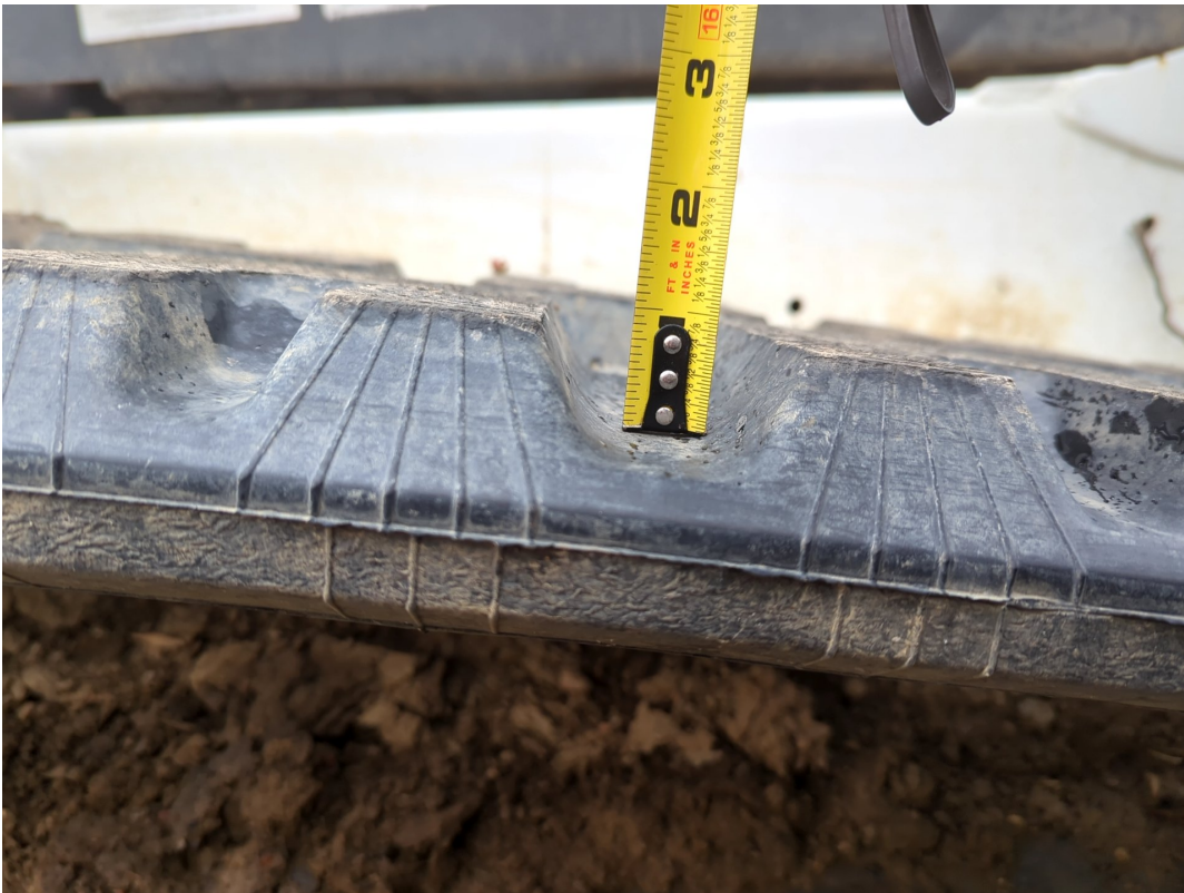
Right Track Tread Depth Measurement / 03-05-2024