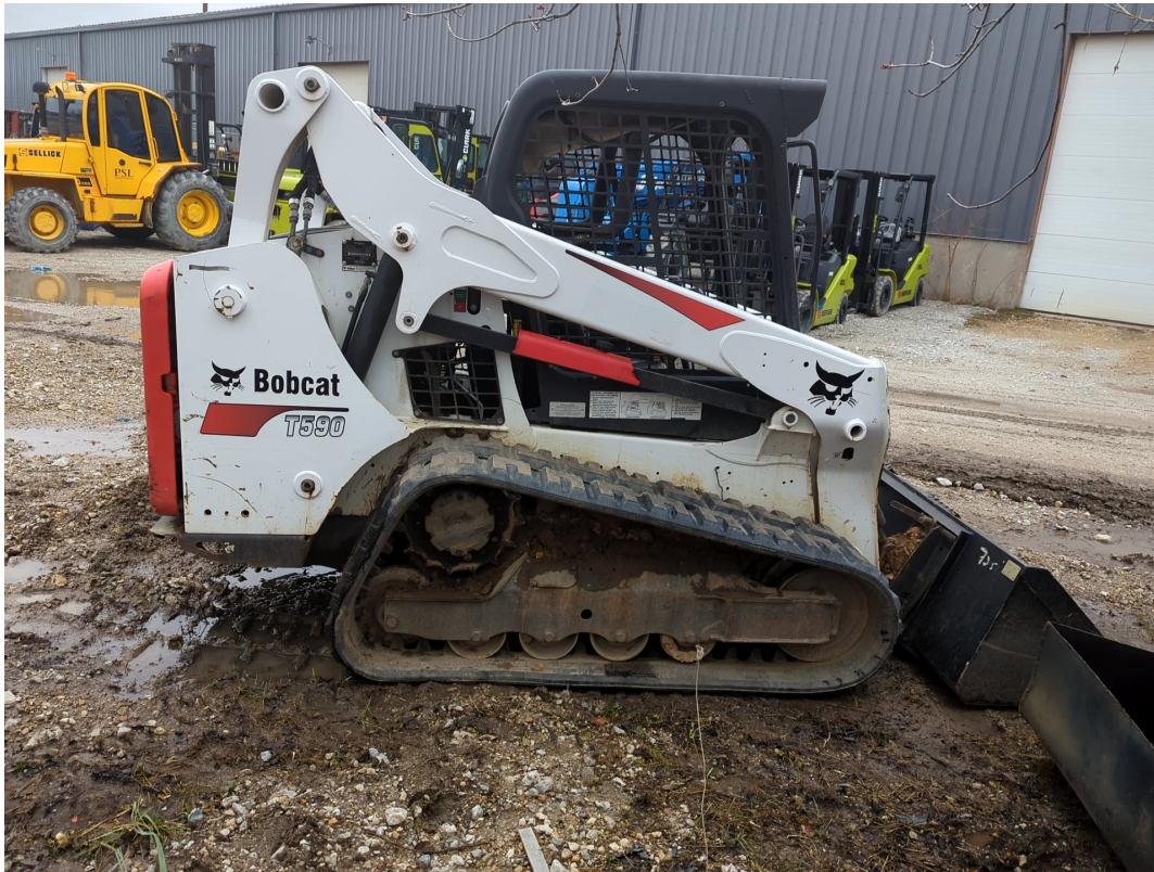
Right / 03-05-2024