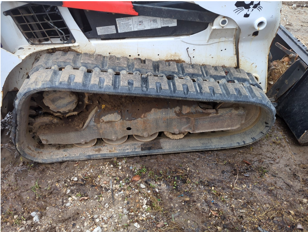
Right Track Condition / 03-05-2024