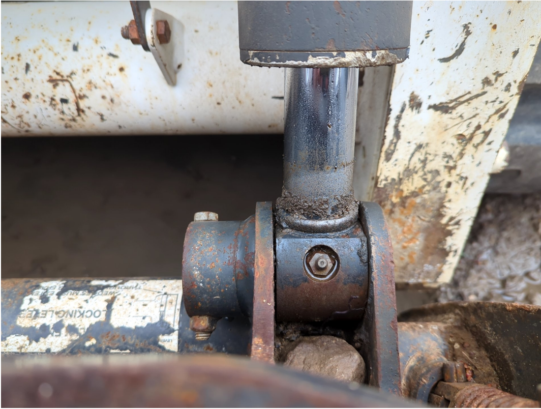
Cylinders / 03-05-2024