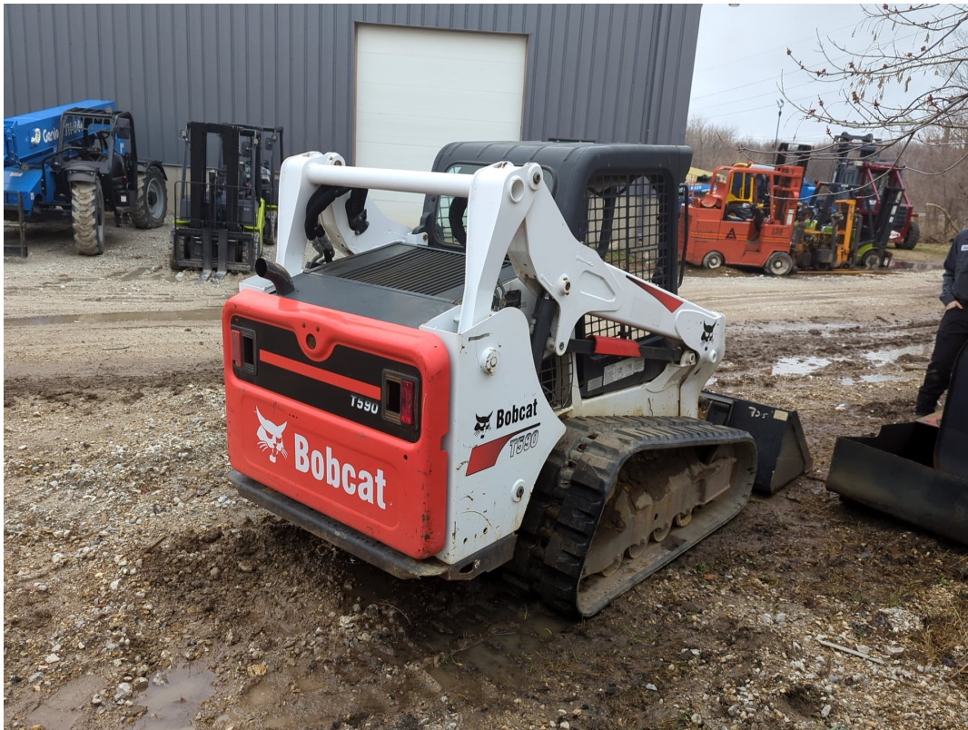
Rear Right / 03-05-2024