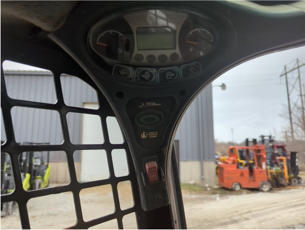
Switches and Controls / 03-05-2024