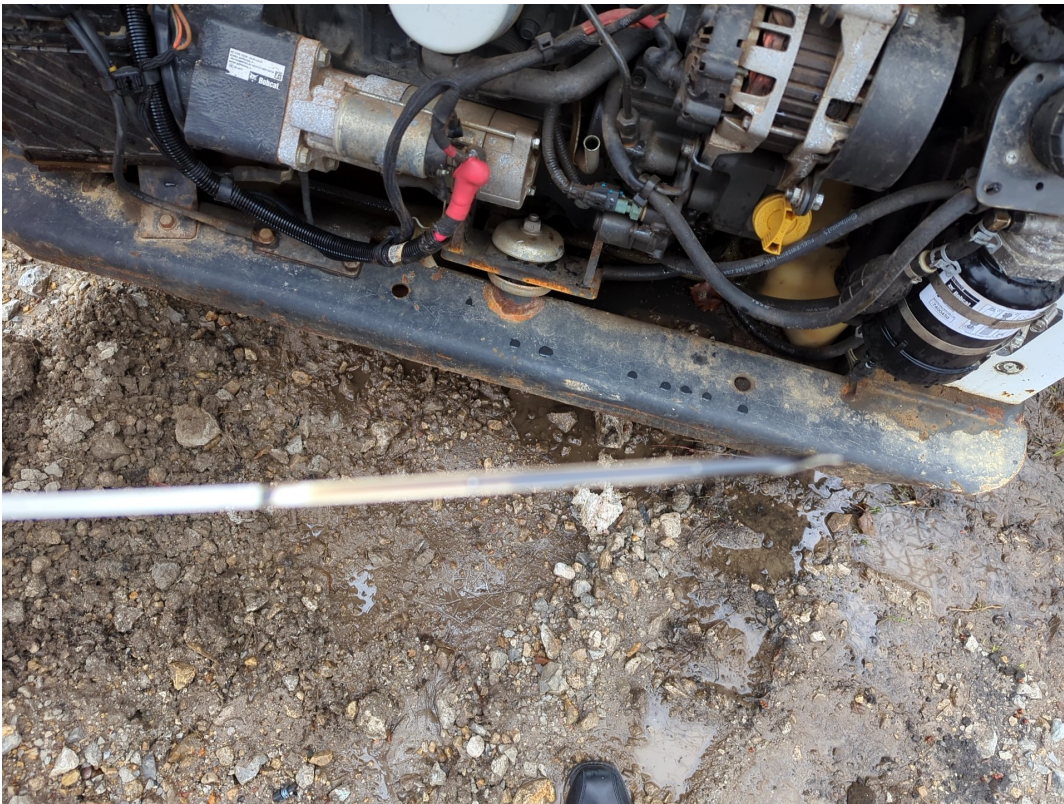
Oil Dipstick / 03-05-2024