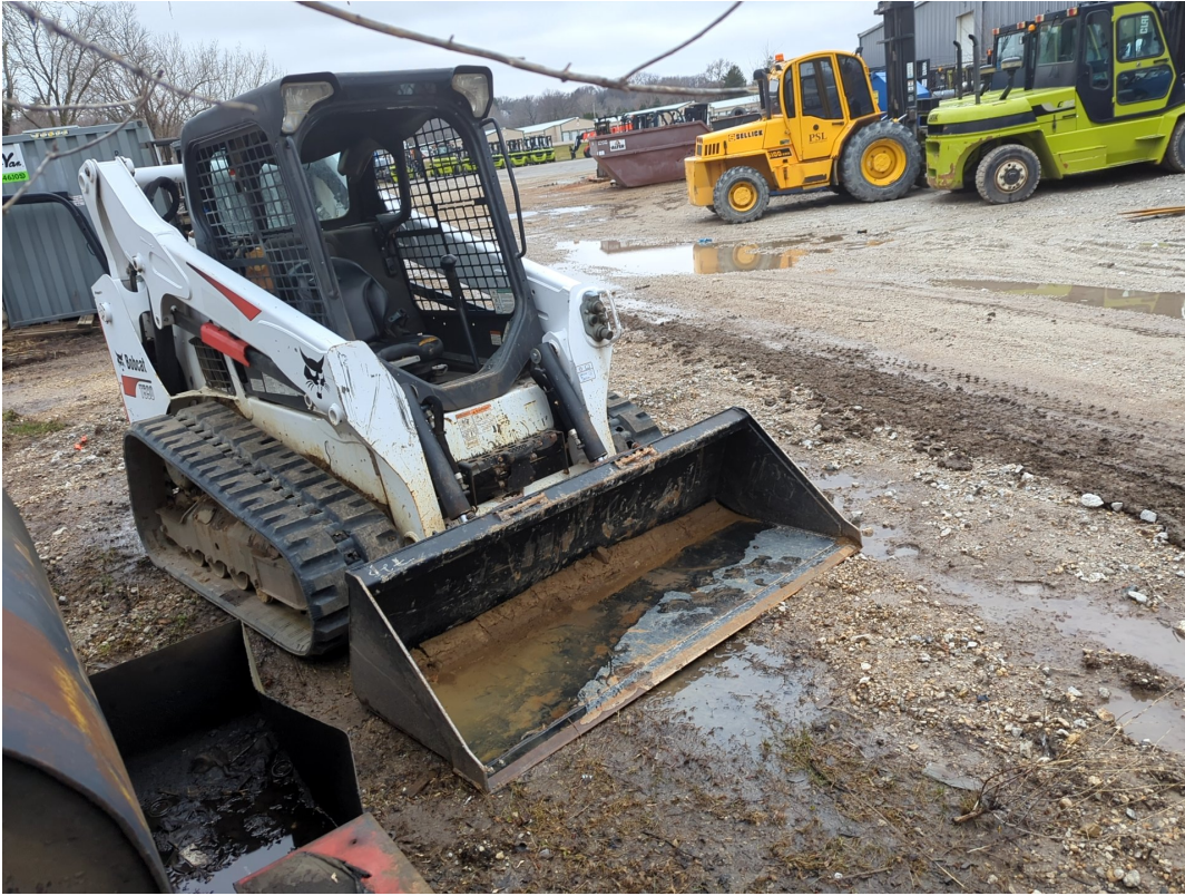
Front Right / Attachments - Bucket / 03-05-2024