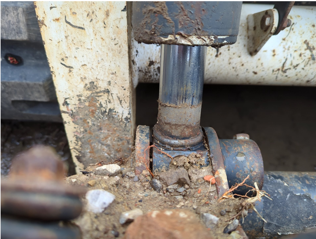
Cylinders / 03-05-2024