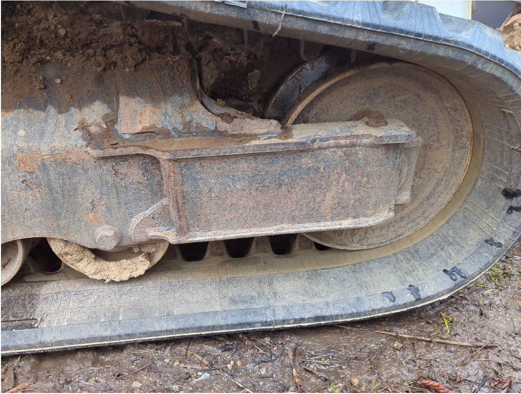
Right Track Condition / 03-05-2024