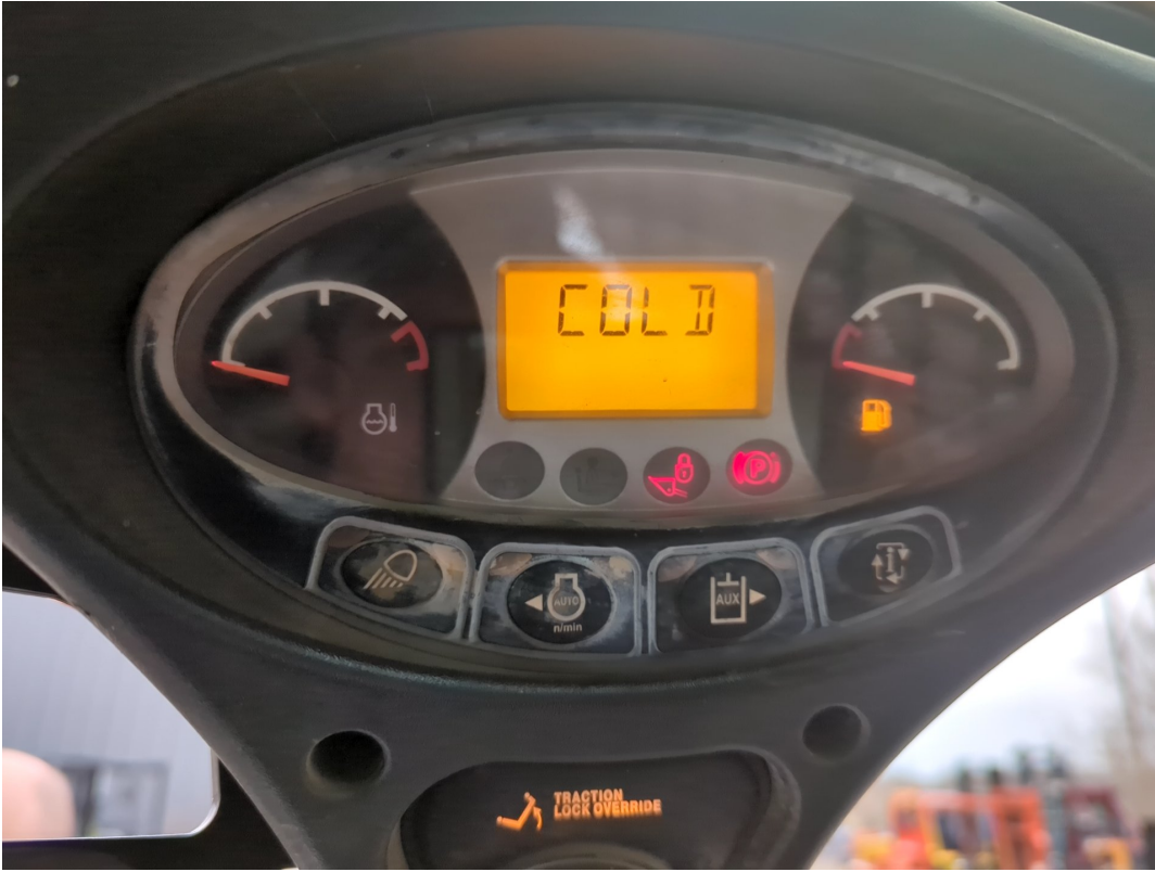
EMS Warning Lights / 03-05-2024