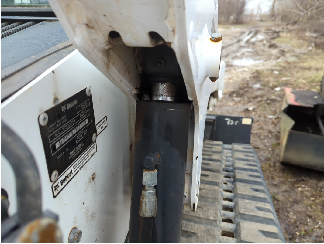
Cylinders / 03-05-2024