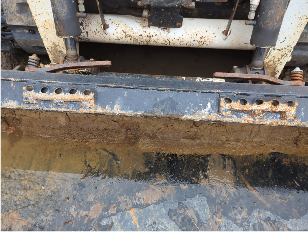
Steps / 03-05-2024