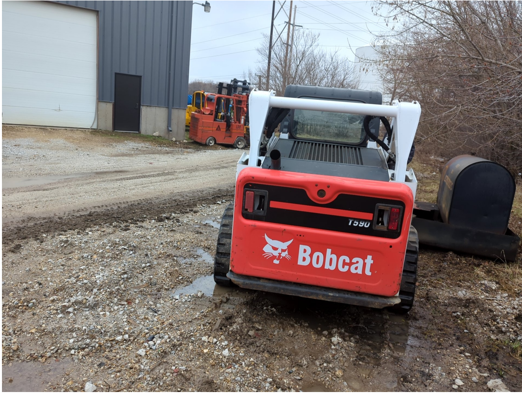
Rear / Rear Lights / 03-05-2024