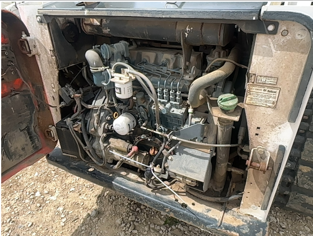
Engine Compartment / 04-26-2024