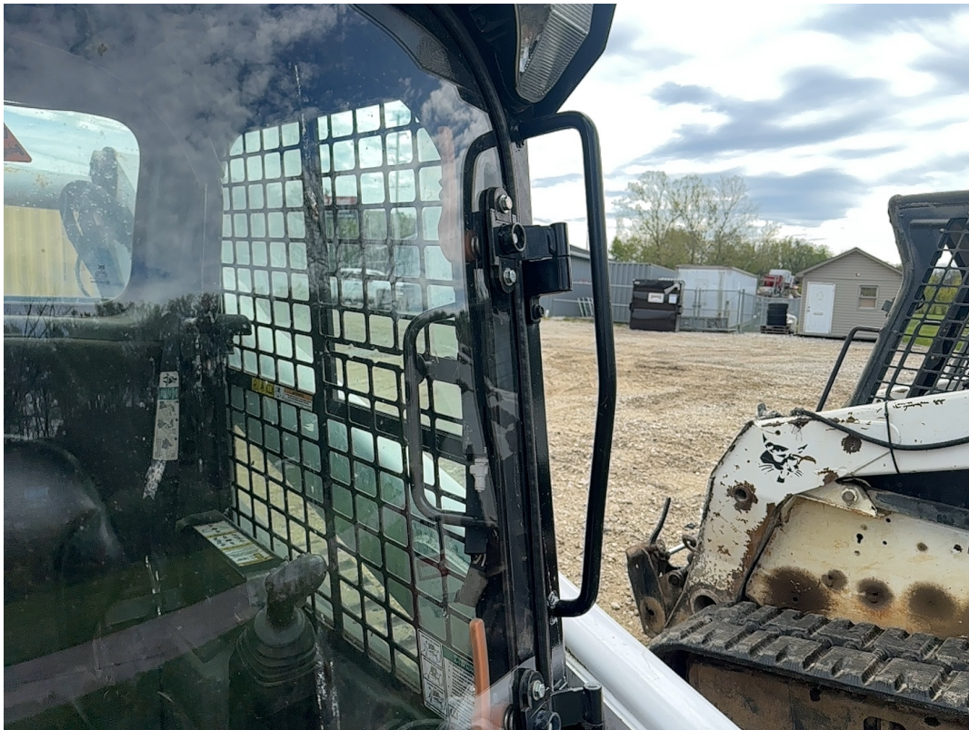
Handrails / 04-26-2024