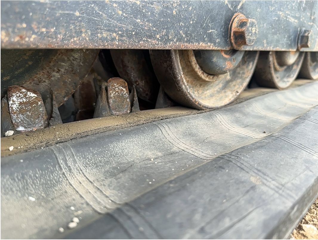
Right Track Condition / 04-26-2024