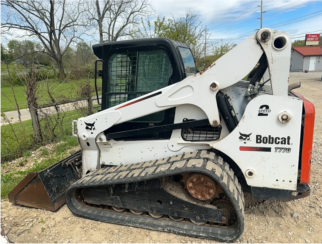
Left / ROPS / 04-26-2024