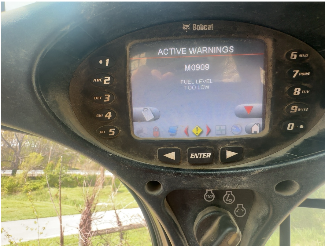
EMS Warning Lights / 04-26-2024