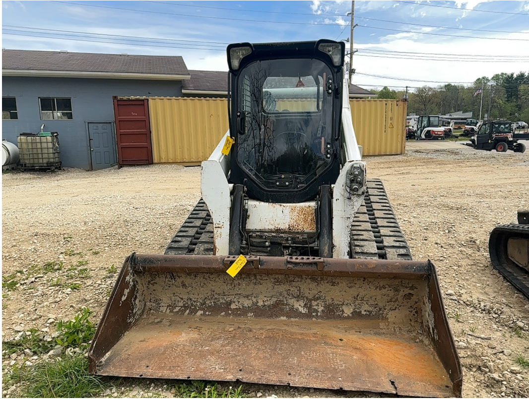
Front / ROPS / 04-26-2024