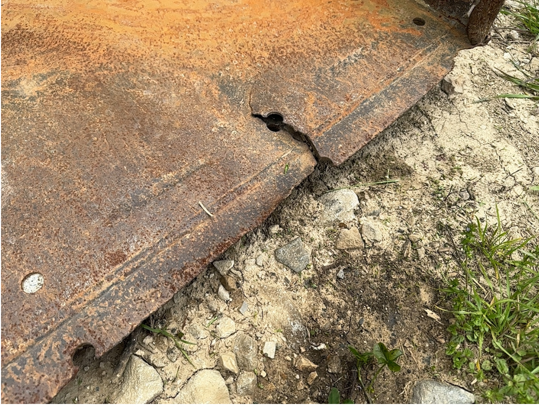
Attachements / 04-26-2024