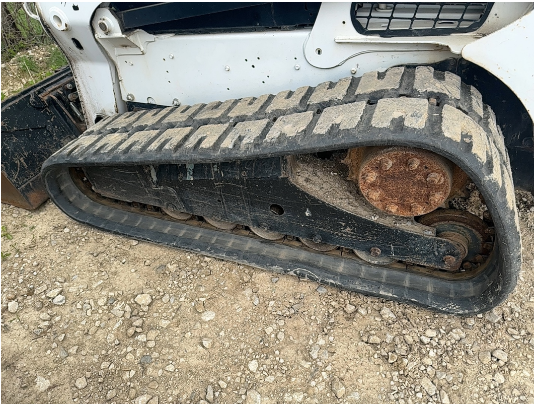
Left Track Condition / 04-26-2024