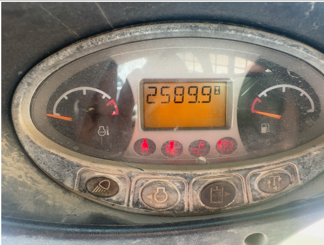
Engine Hours: 2,589 / 04-26-2024