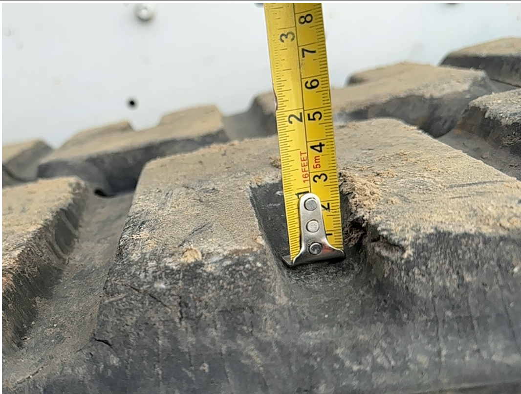
Left Track Tread Depth Measurement / 04-30-2024