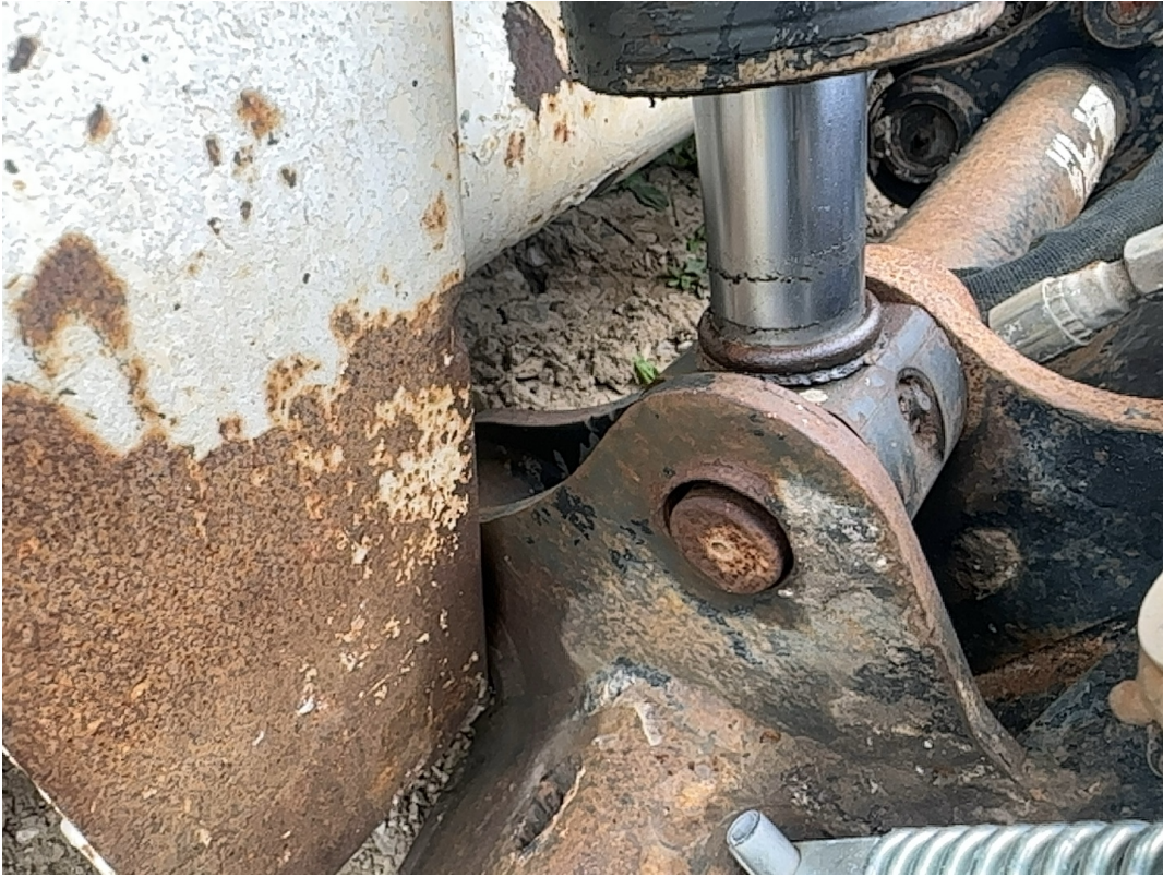
Cylinders / 04-26-2024