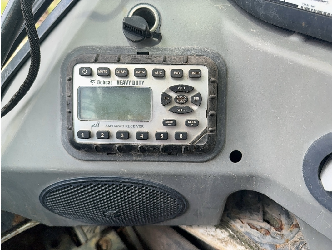
Switches and Controls / Radio / 04-26-2024