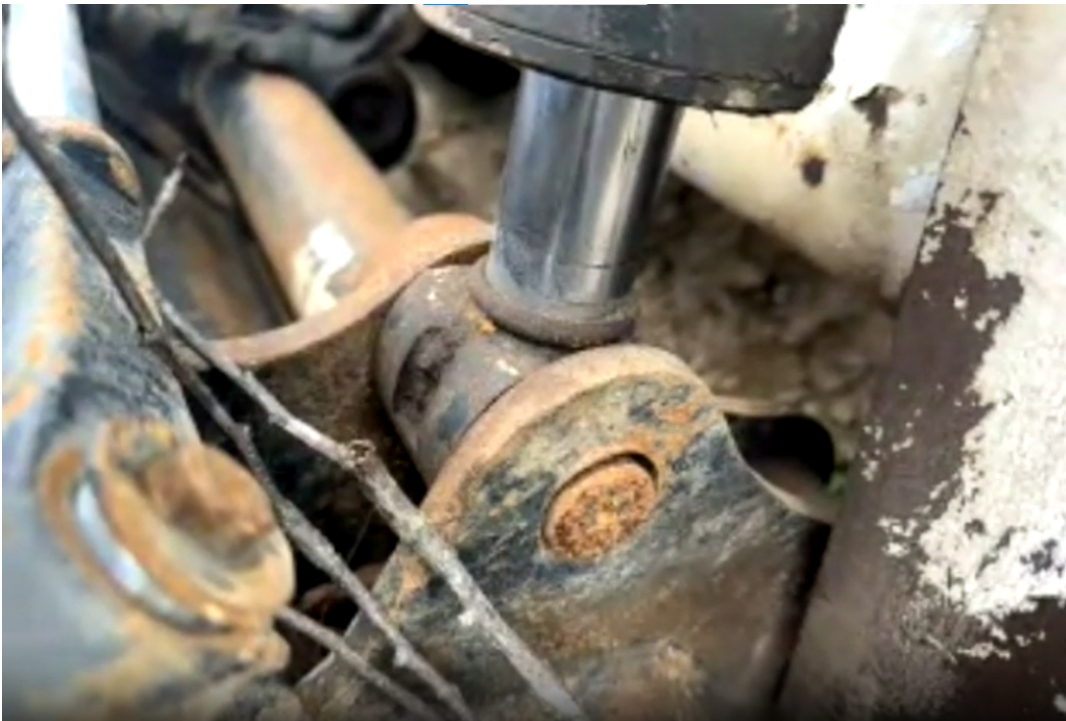
Cylinders / 04-30-2024