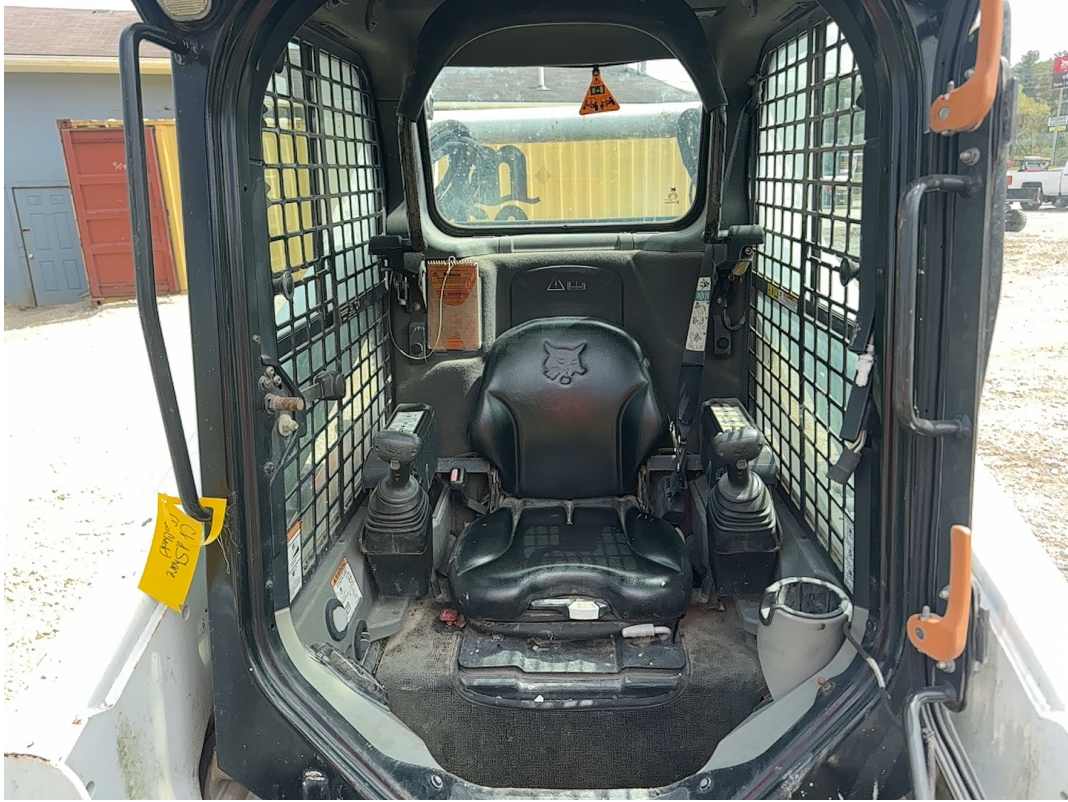
Cab Interior / Operator's Seat / 04-26-2024