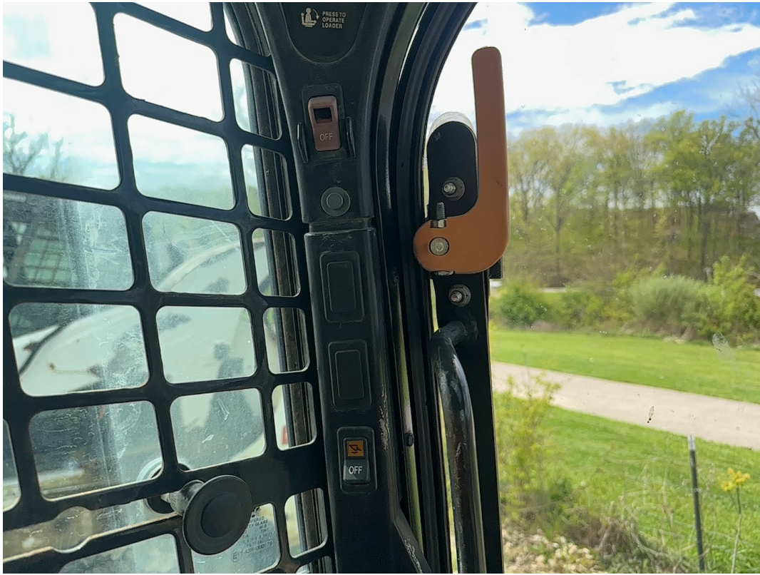
Switches and Controls / 04-26-2024