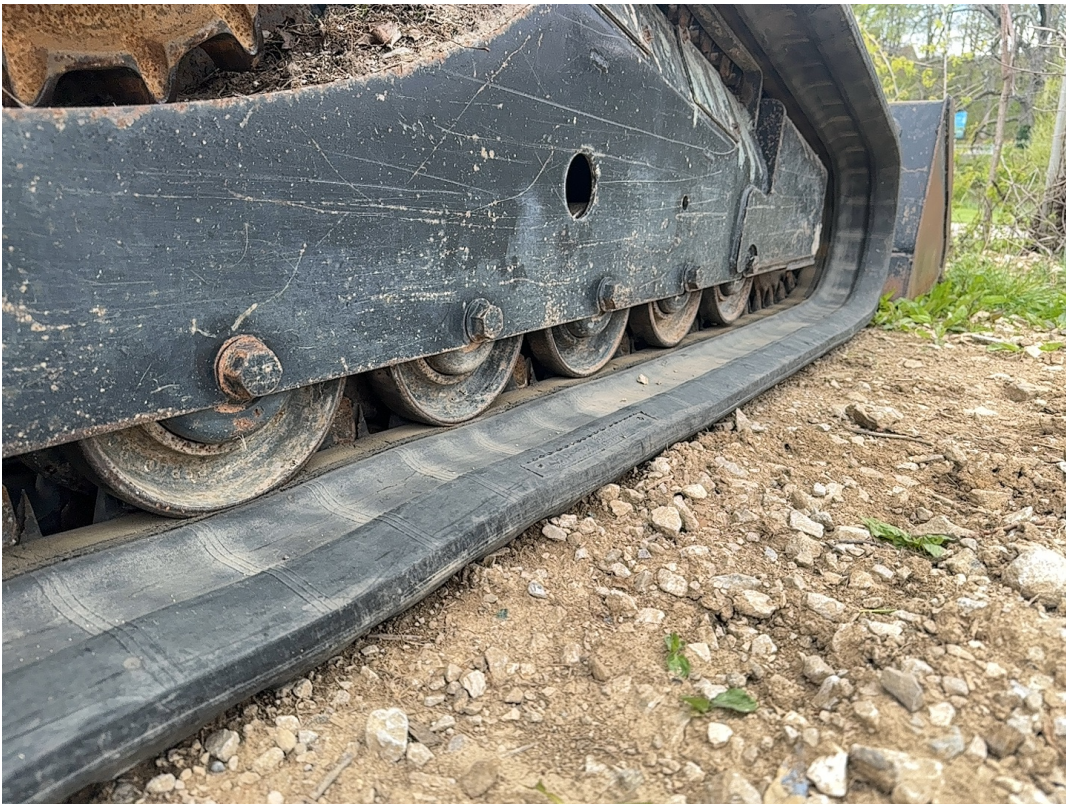
Right Track Condition / 04-26-2024