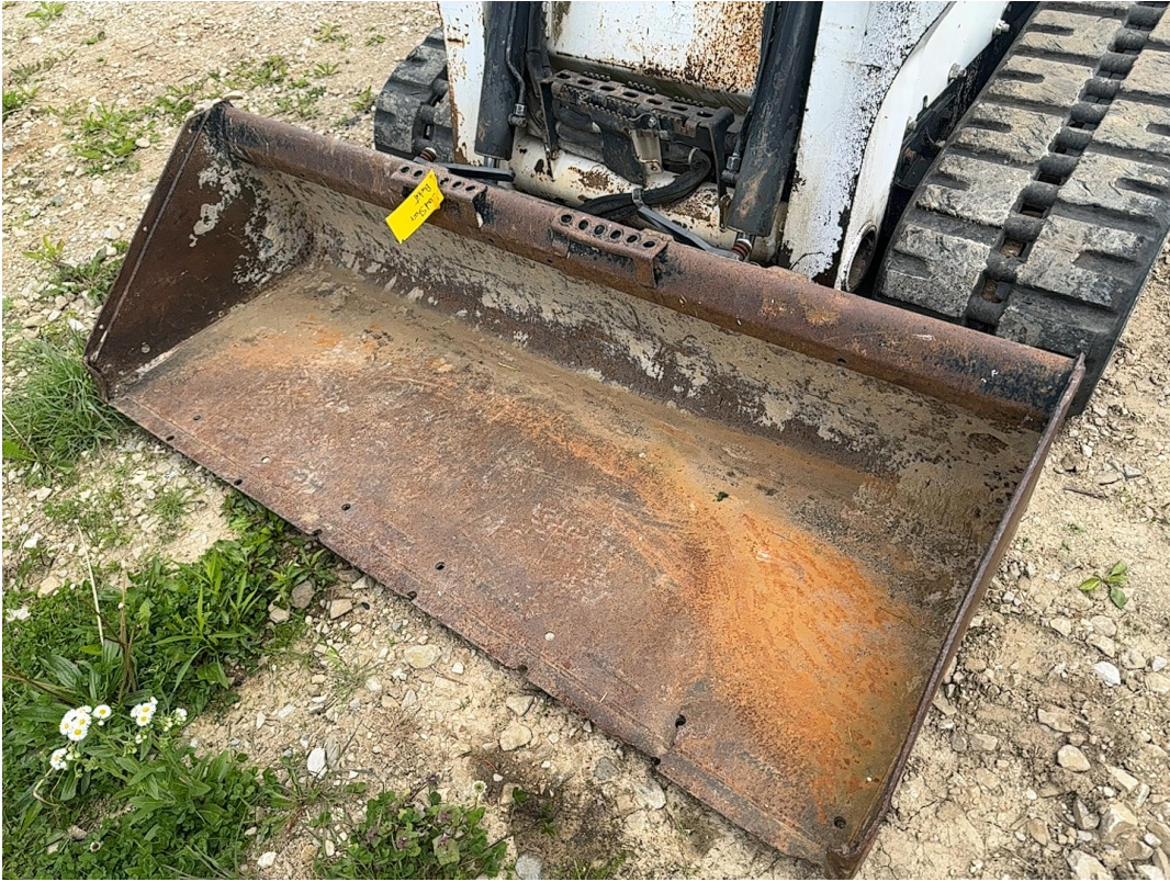
Attachements / 04-26-2024