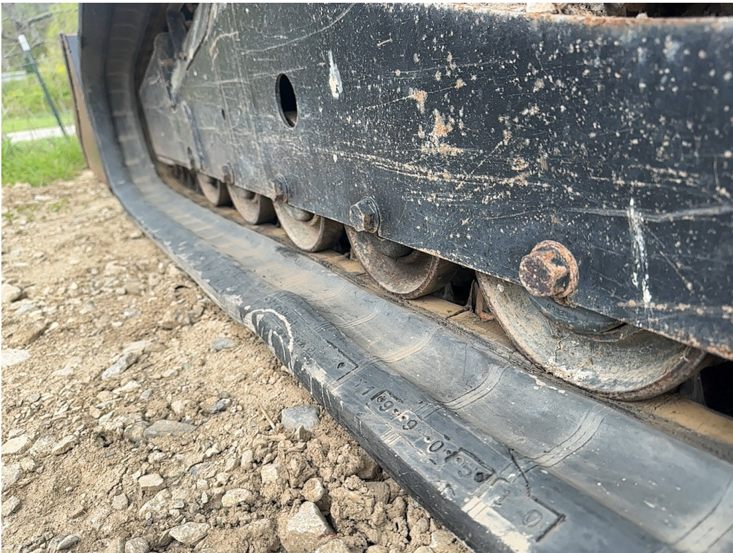
Left Track Condition / 04-26-2024