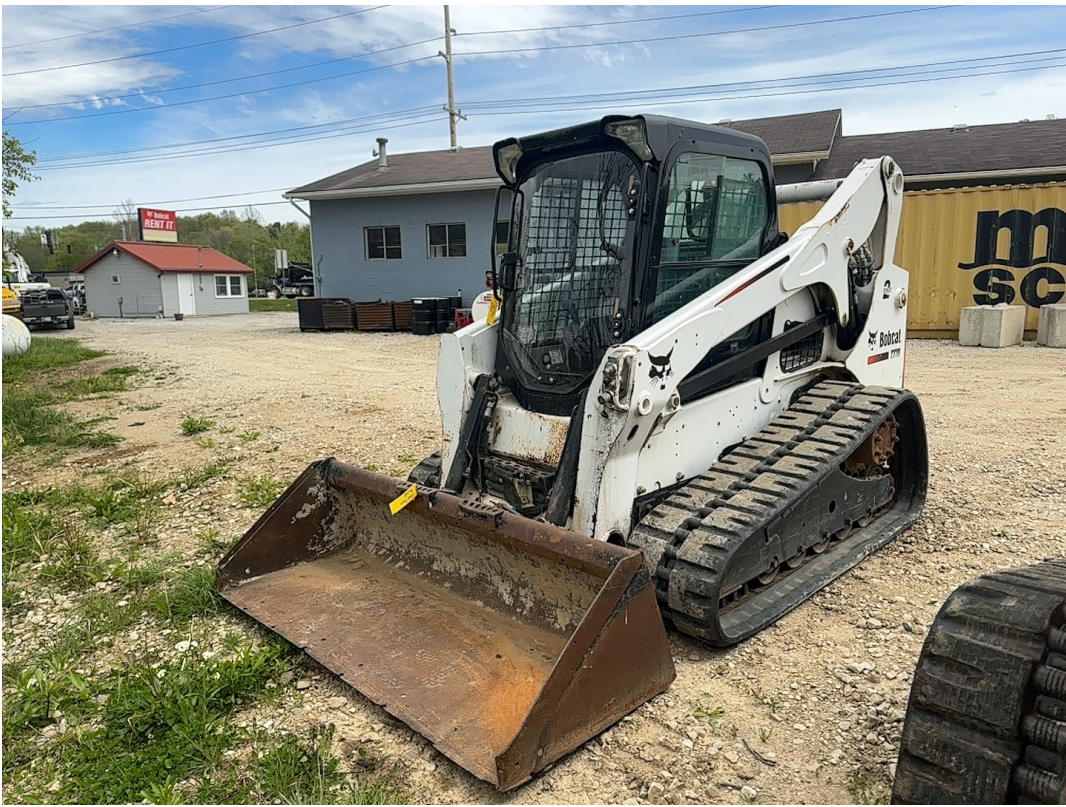
Front Left / ROPS / 04-26-2024