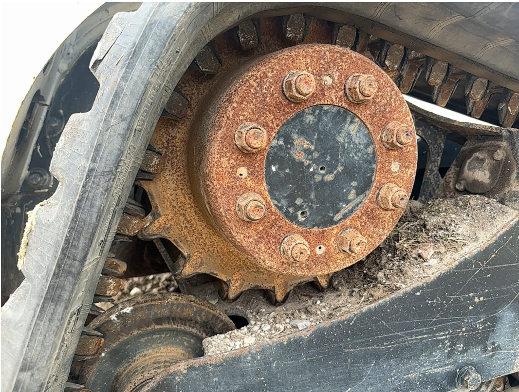
Right Track Condition / 04-26-2024