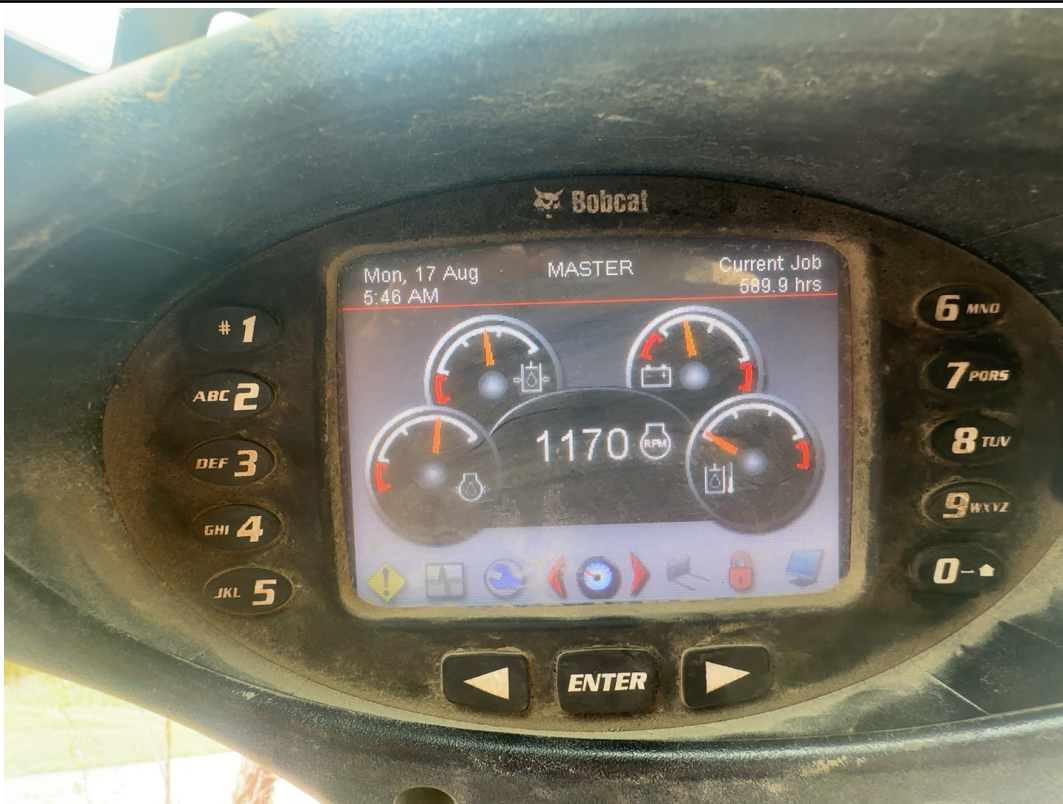
EMS Warning Lights / 04-26-2024