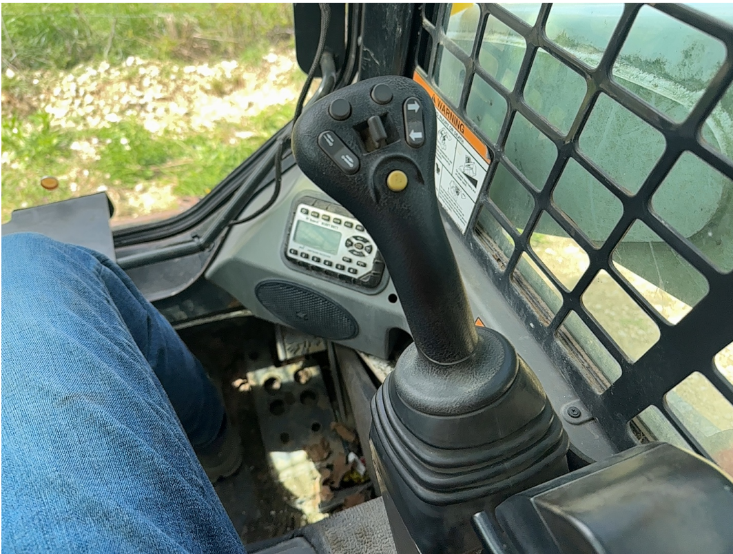
Switches and Controls / Travel Control / Floorboard / Pedals / 04-26-2024