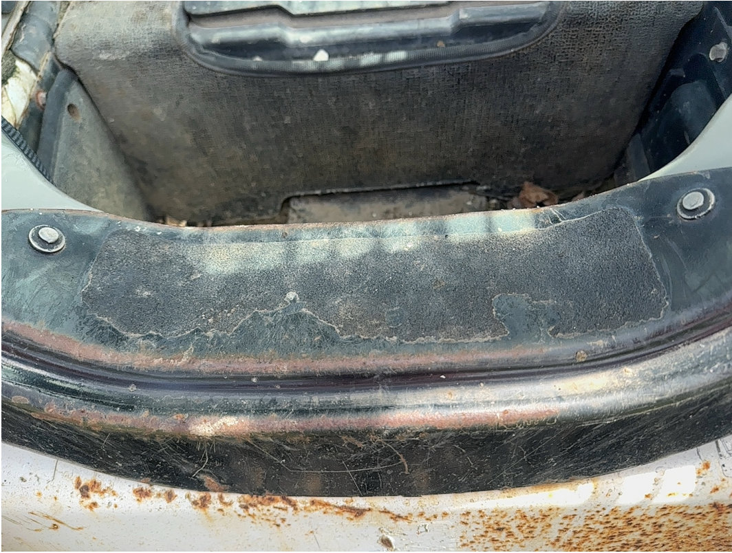
Steps / 04-26-2024