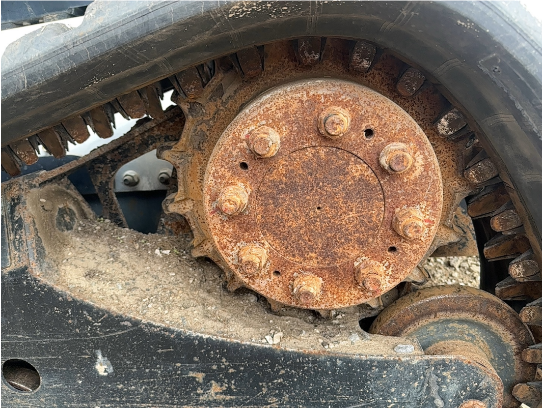
Left Track Condition / 04-26-2024