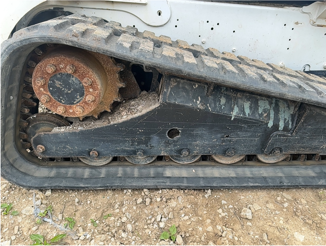
Right Track Condition / 04-26-2024