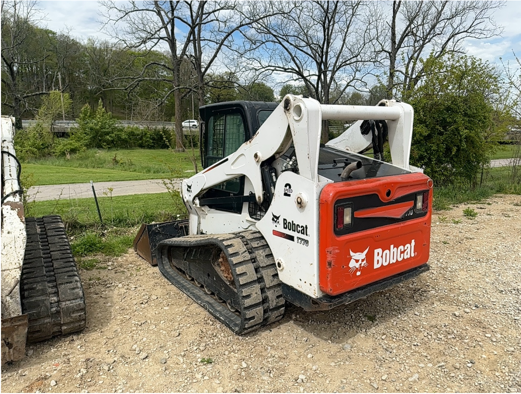
Rear Left / 04-26-2024