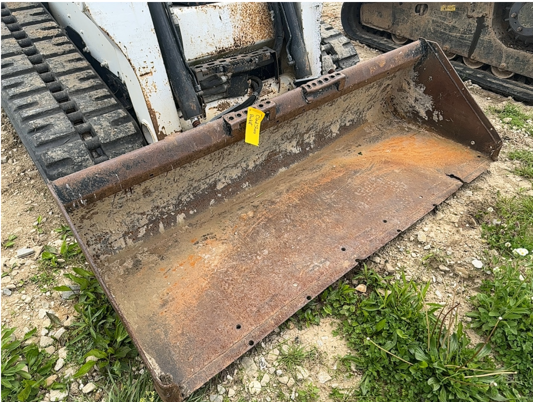
Attachements / 04-26-2024