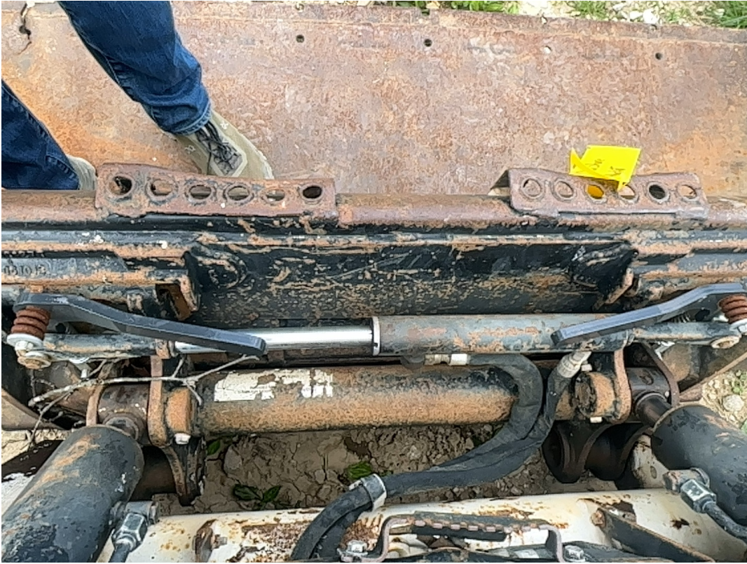
Cylinders / 04-26-2024