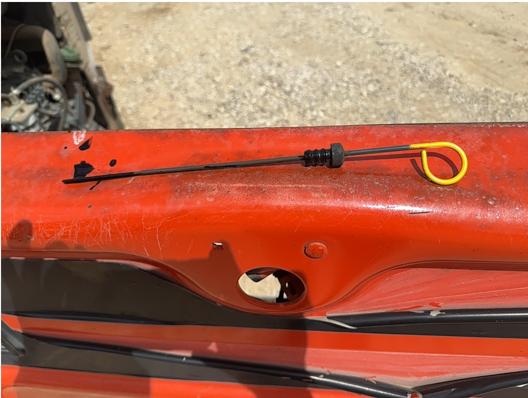
Oil Dipstick / 04-26-2024