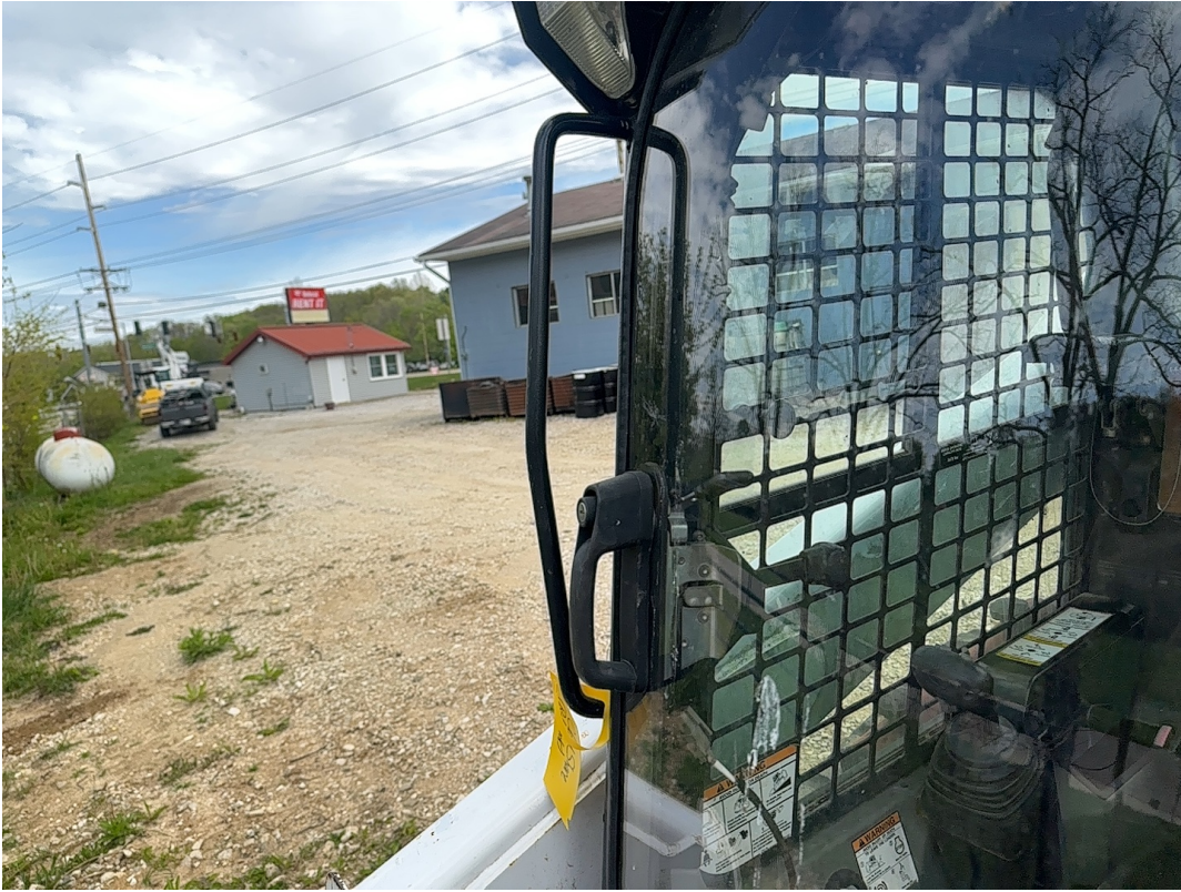
Handrails / 04-26-2024