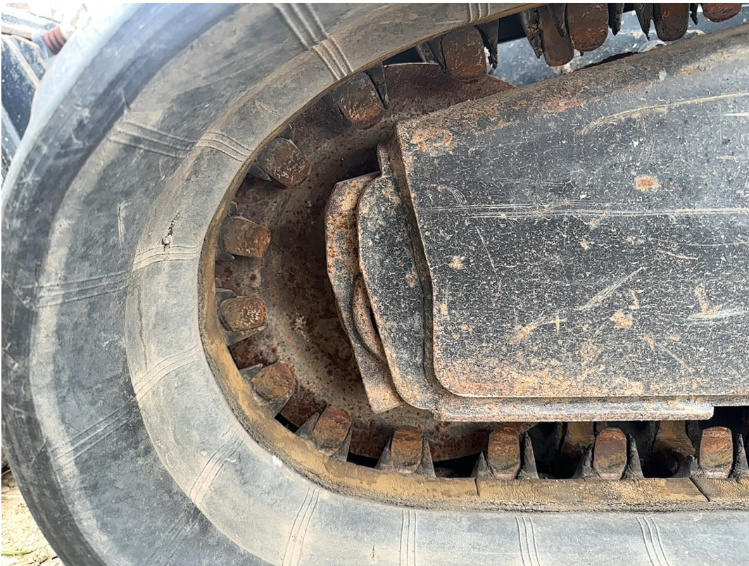
Left Track Condition / 04-26-2024