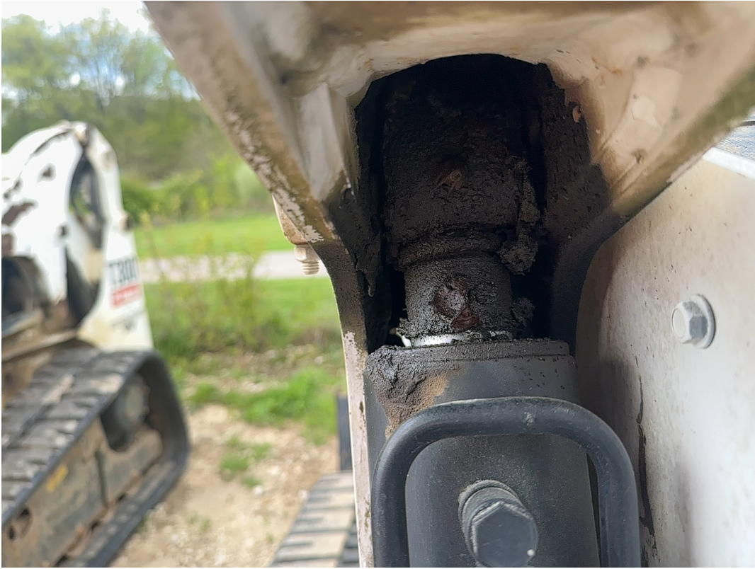
Cylinders / 04-26-2024