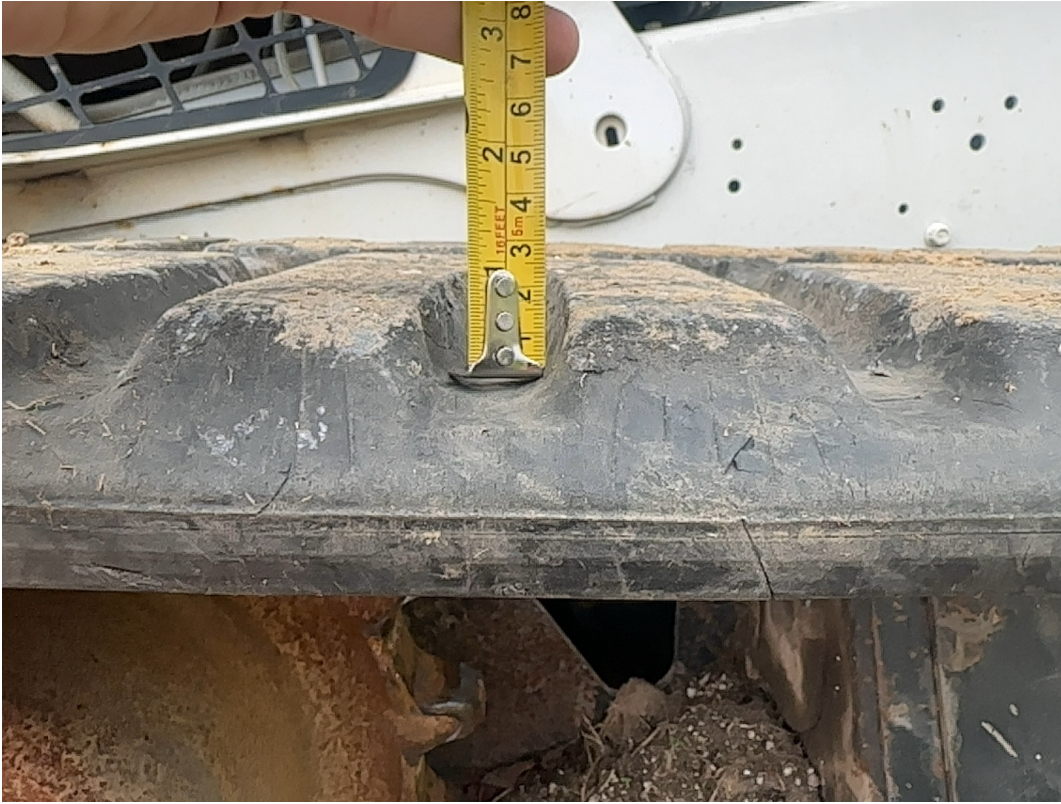
Right Track Tread Depth Measurement / 04-26-2024