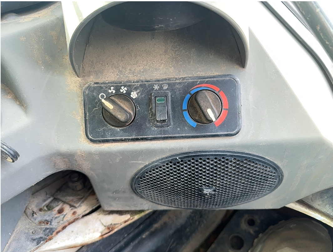
Switches and Controls / A/C / 04-26-2024