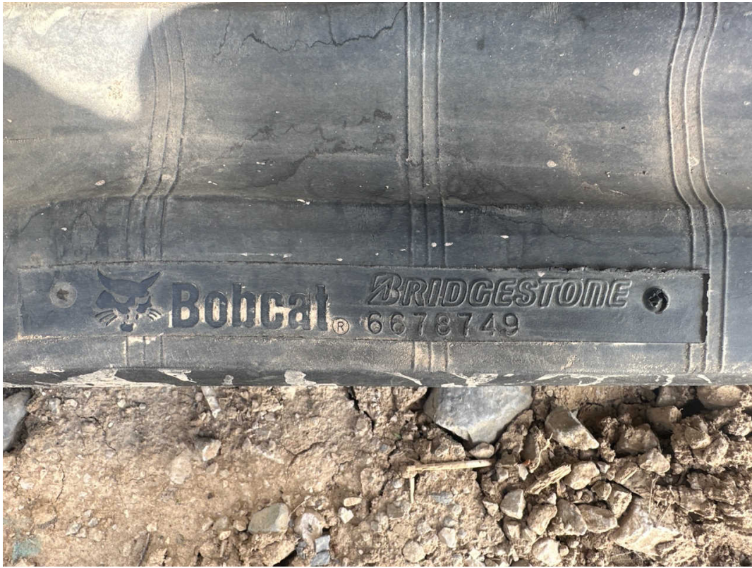
Left Track Brand / Left Track Size / 04-30-2024