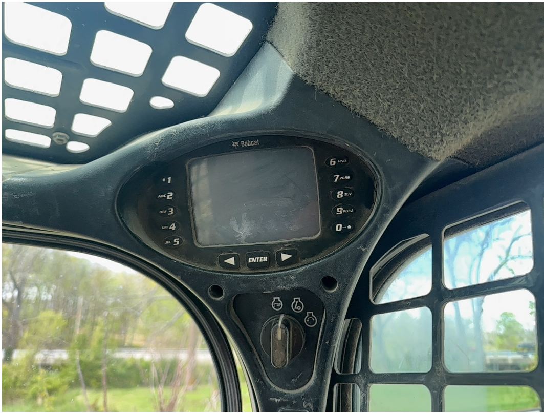
Switches and Controls / 04-26-2024