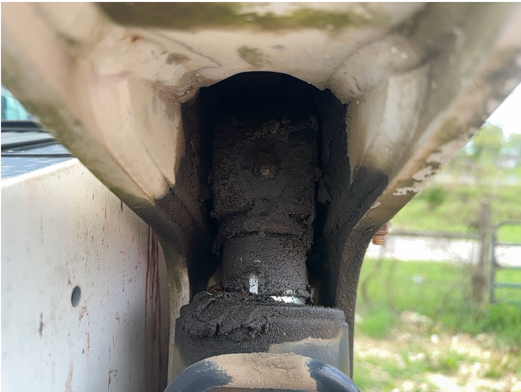
Cylinders / 04-26-2024