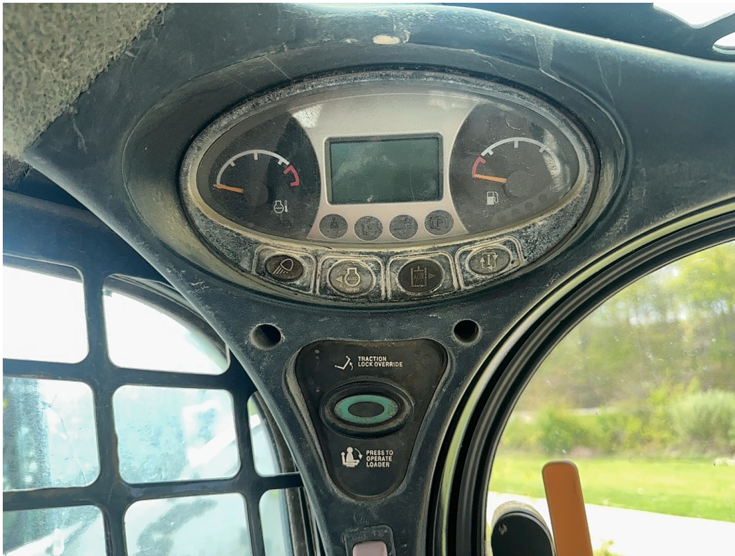
Switches and Controls / 04-26-2024