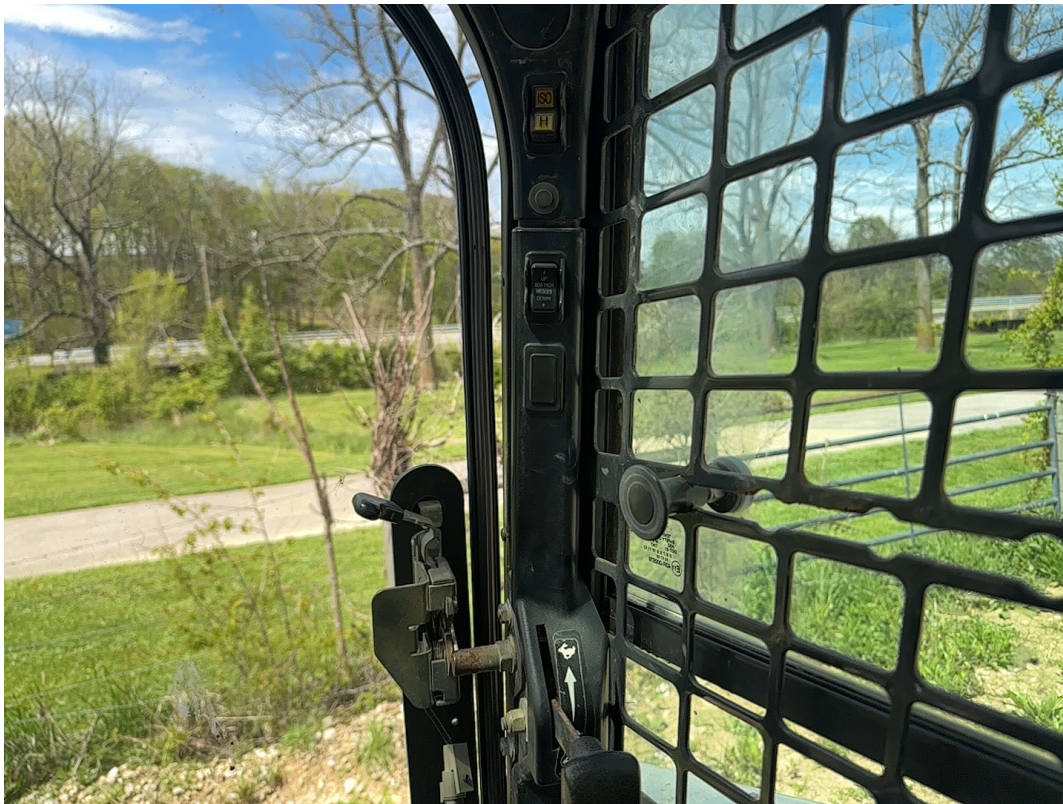
Switches and Controls / 04-26-2024