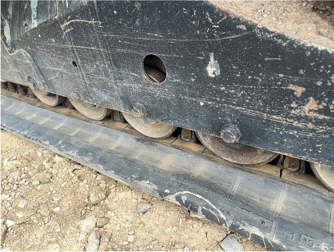
Left Track Condition / 04-26-2024