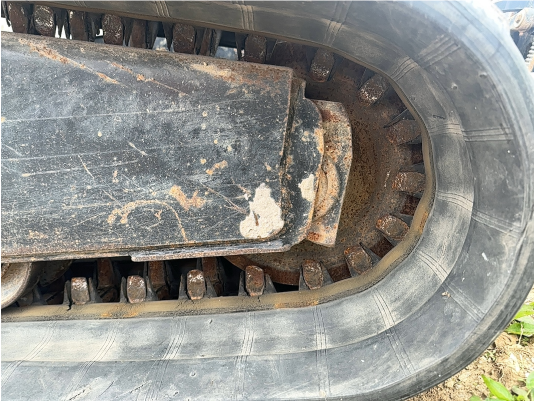
Right Track Condition / 04-26-2024