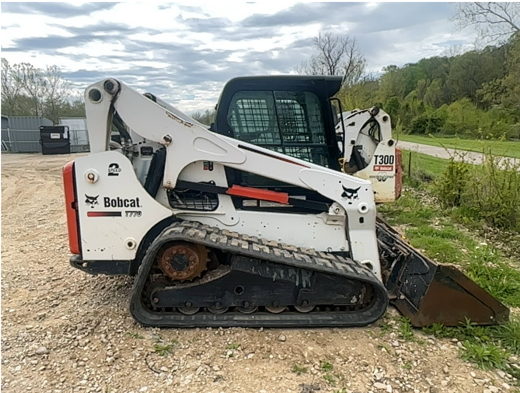
Right / ROPS / 04-26-2024