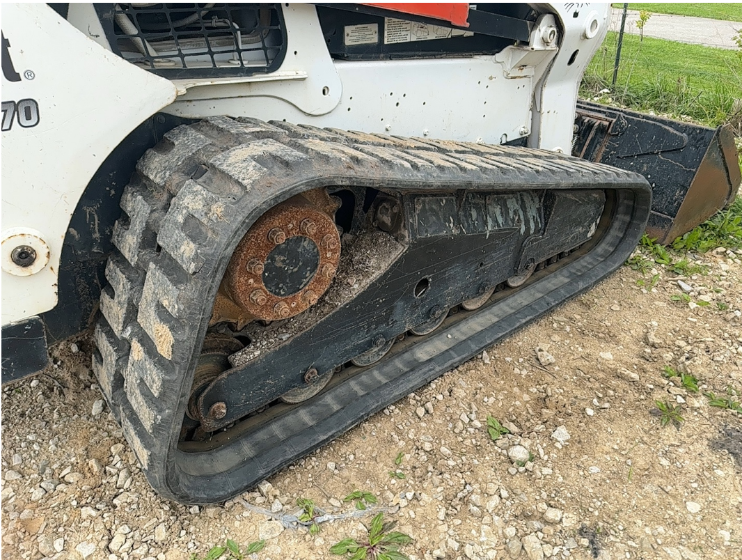
Right Track Condition / 04-26-2024