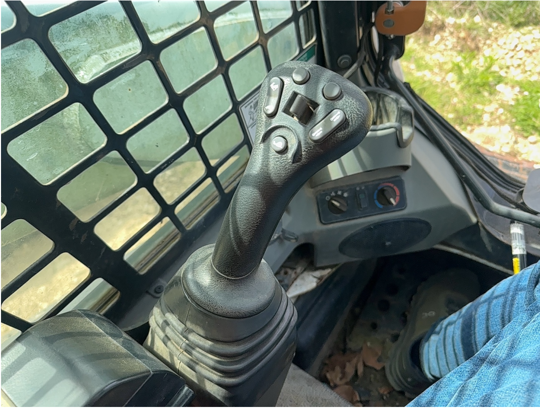
Switches and Controls / Travel Control / 04-26-2024