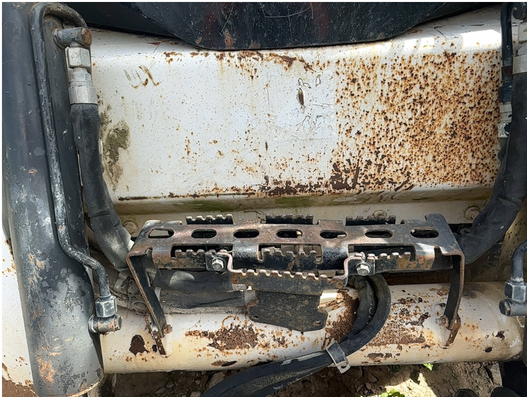
Steps / 04-26-2024