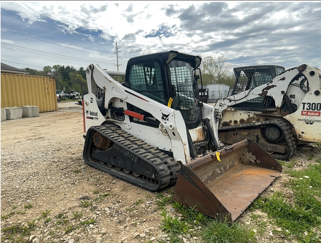
Front Right / ROPS / 04-26-2024