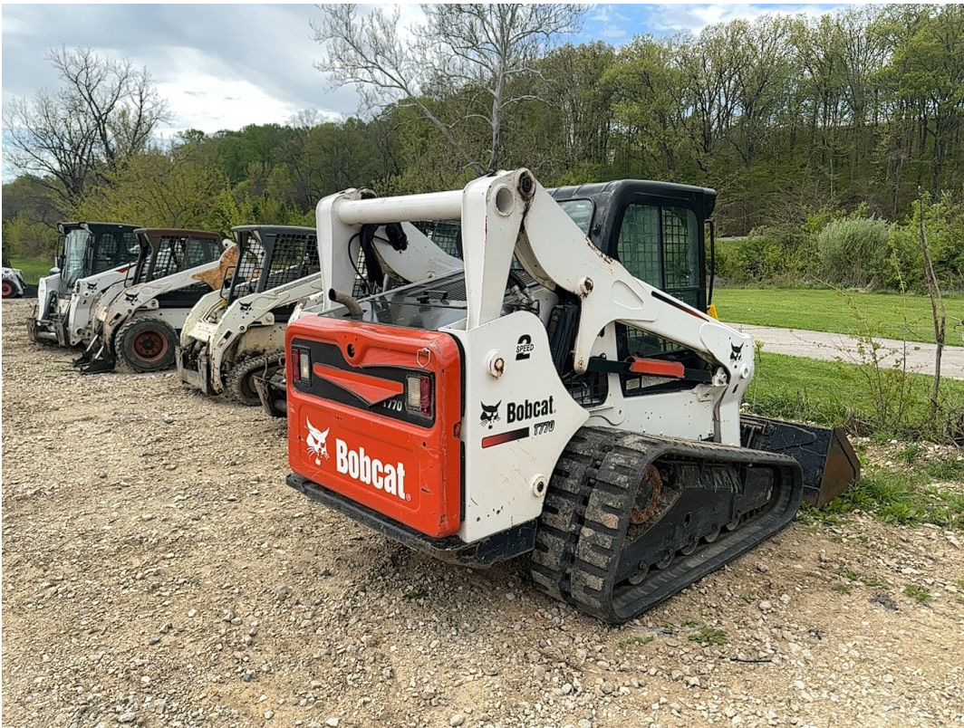
Rear Right / 04-26-2024