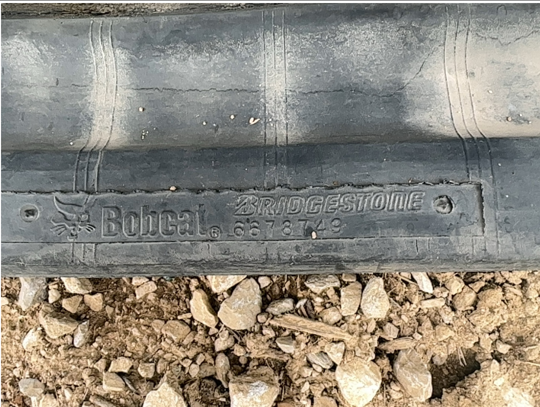
Right Track Brand / Right Track Size / 04-26-2024