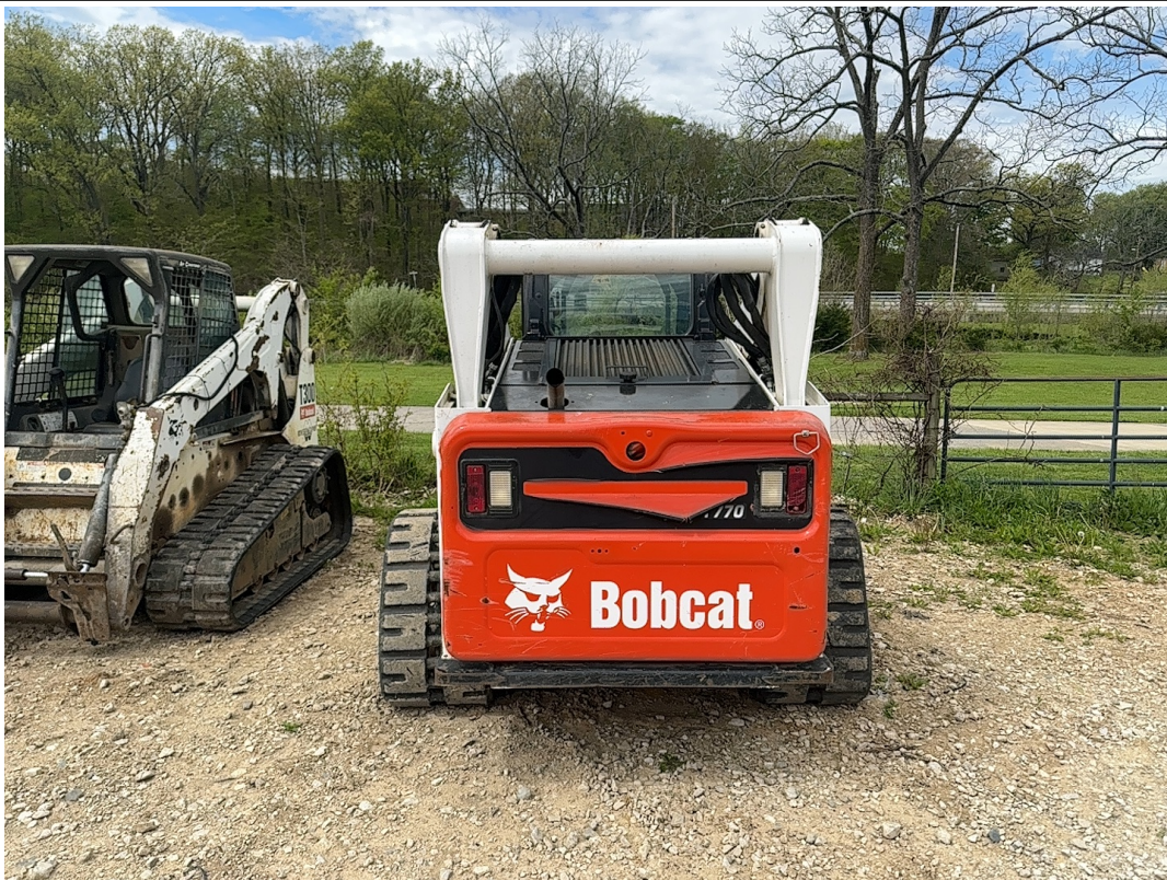
Rear / Rear Lights / ROPS / 04-26-2024