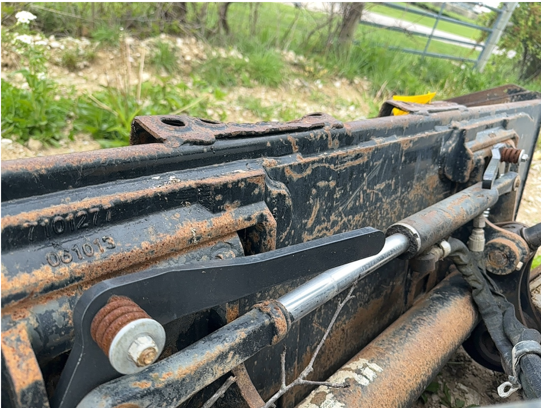
Cylinders / 04-26-2024