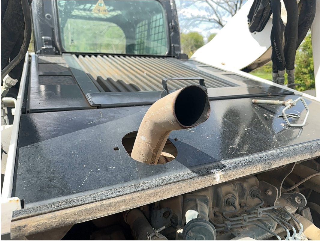
Exhaust Pipe / 04-26-2024