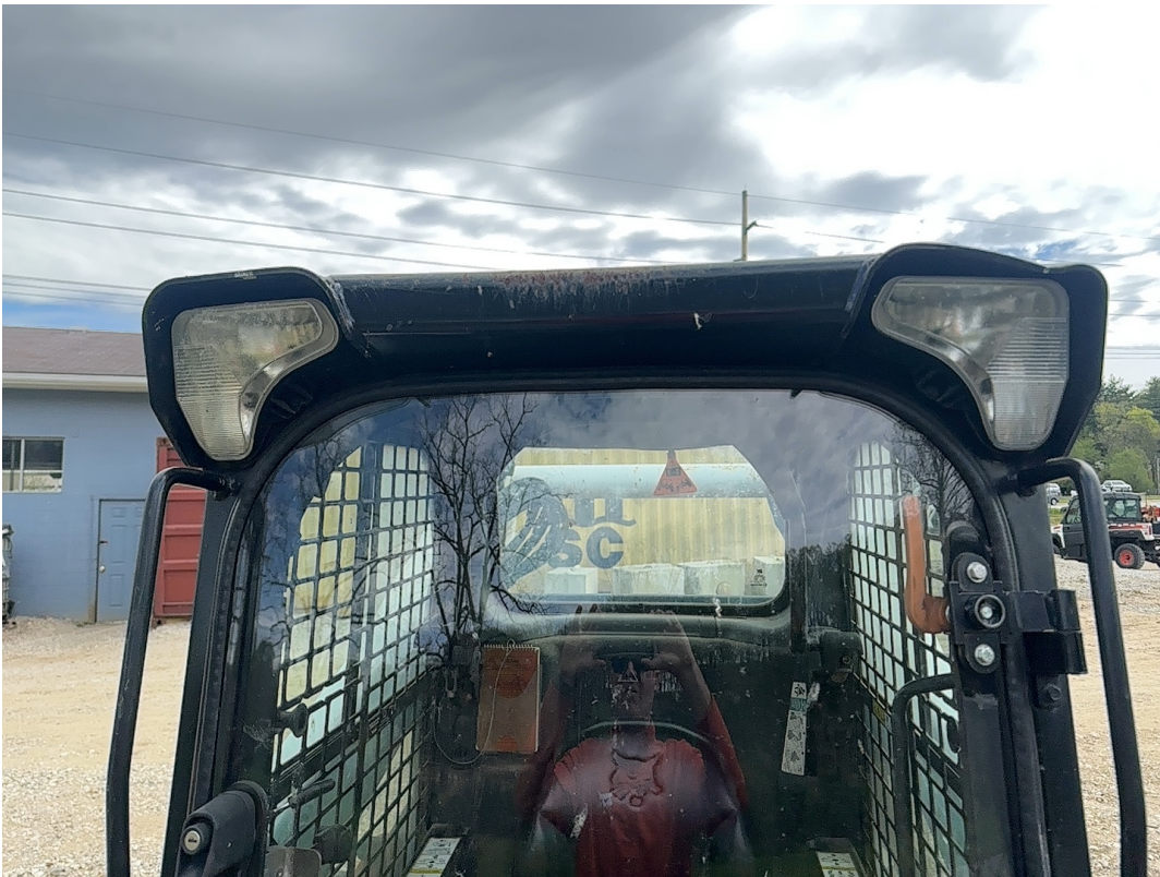
Front Lights / 04-26-2024