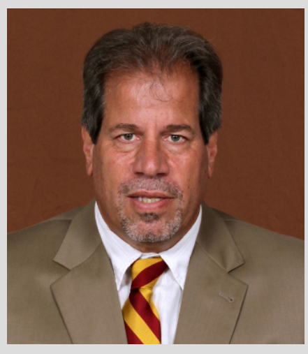
2014 NSCAA National Coach of the Year 2005, '14 Soccer America Nat'l Coach of the Year 2005, '09, '12, '14 ACC Coach of the Year Eight-time Regional Coach of the Year