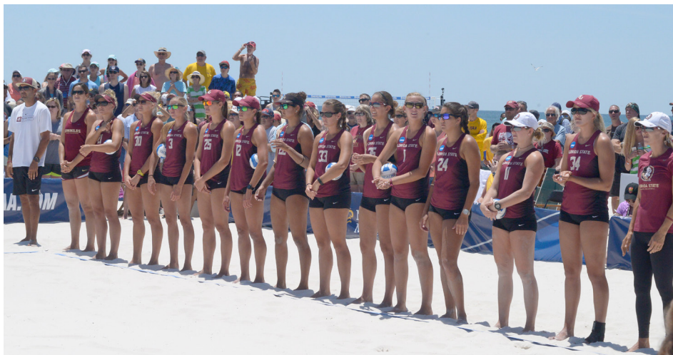
THE FLORIDA STATE BEACH VOLLEYBALL TEAM AS IT IS BEING ANNOUNCED AT THE 2016 NCAA CHAMPIONSHIP MATCH AGAINST SOUTHERN CALIFORNIA