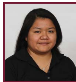
Ana Auger-Crossman Equipment