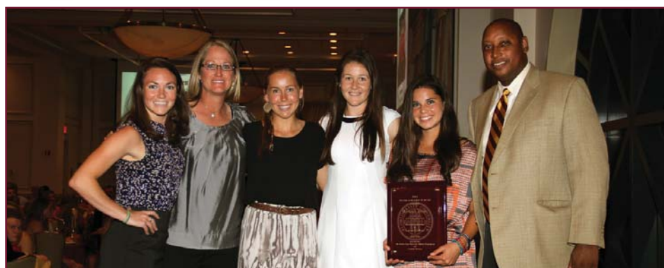
2014 Golden Torch Awards