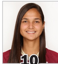
10 Deyna Castellanos FR • 5-7 • F Maracay, Venezuela