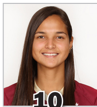
10 Deyna Castellanos FR • 5-7 • F Maracay, Venezuela