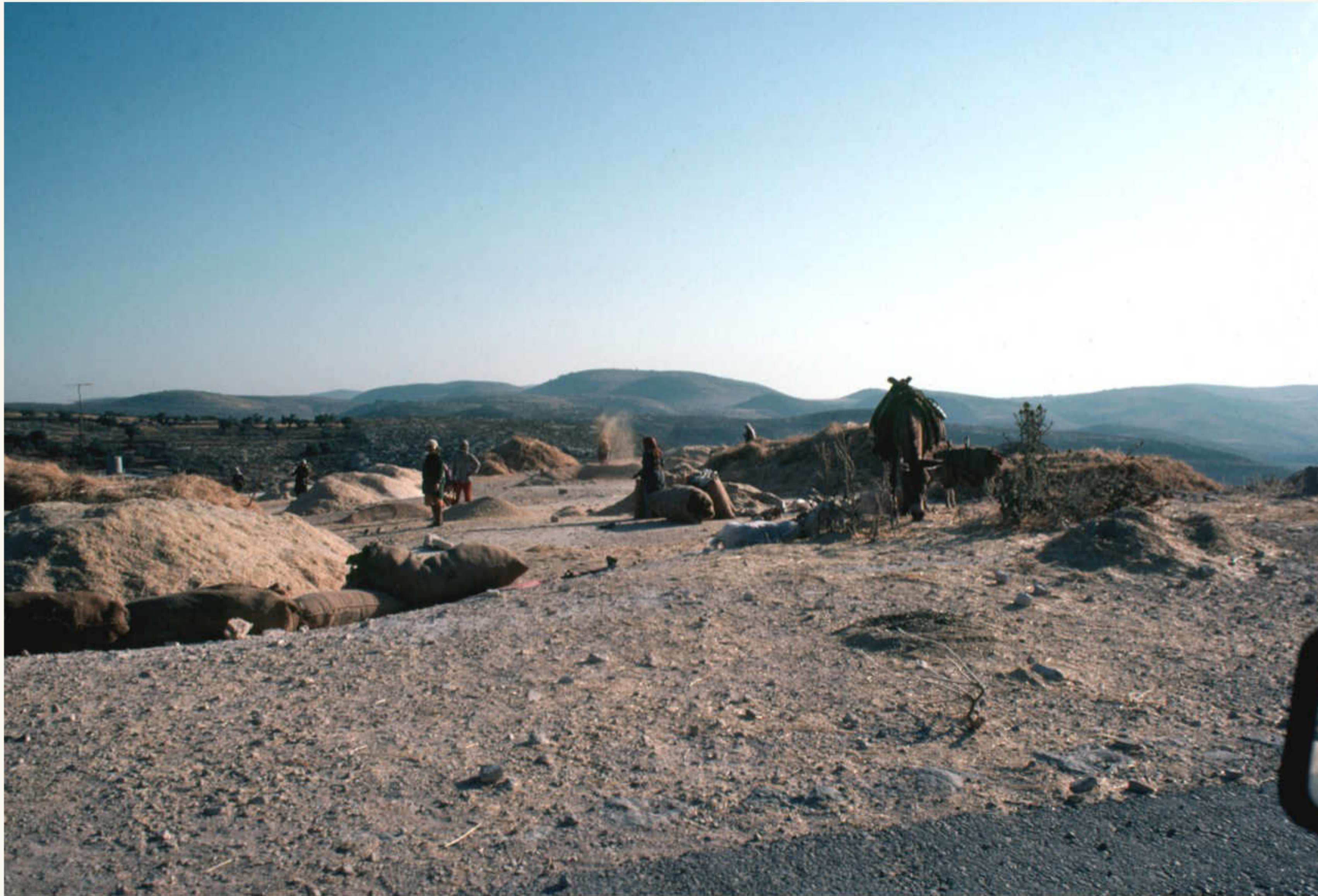
View of a threshing floor in the Hill Country of Ephraim.