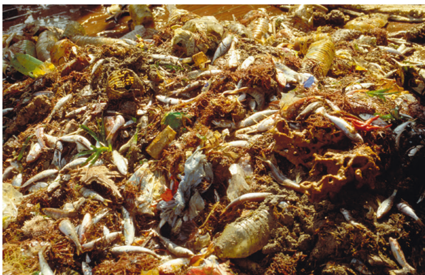
Fig. 2.1 Litter collected by trawling in the Mediterranean Sea, France. 10 min experiment