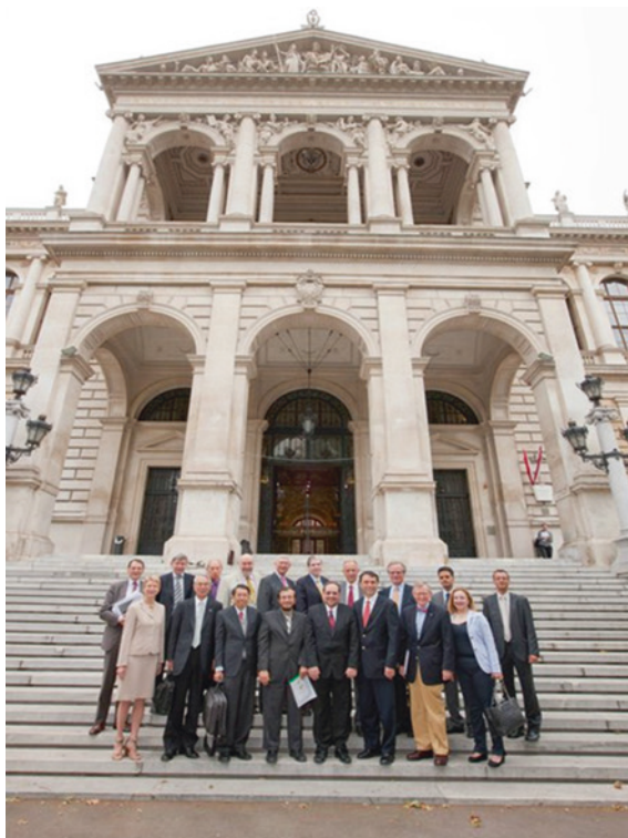
Fig. 2 IAB second meeting at Vienna University, Austria