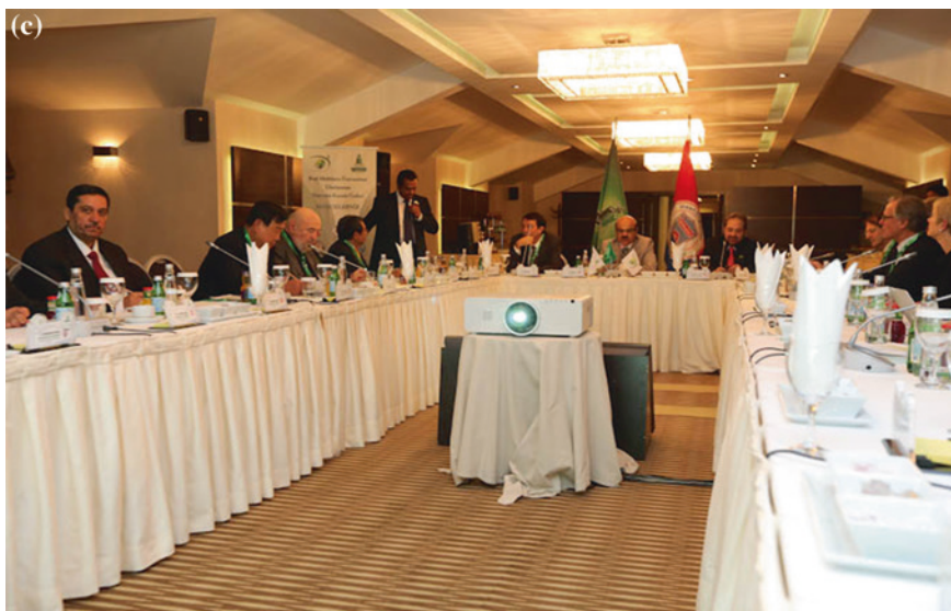
Fig. 4 (continued)