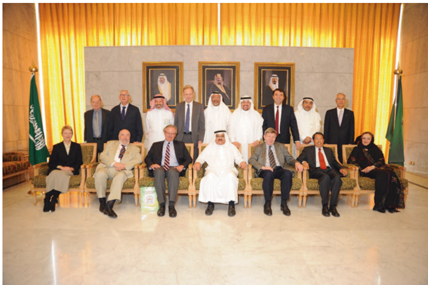
Fig. 1 IAB first meeting at King Abdulaziz University, Jeddah, KSA