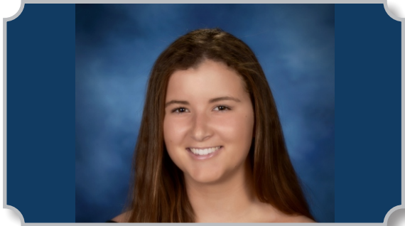
IRSC- Health Studies Designated Student Speaker