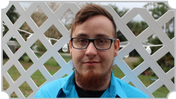
IRSC - Information Technology Curtis Coutts Award for Dedicated Educator