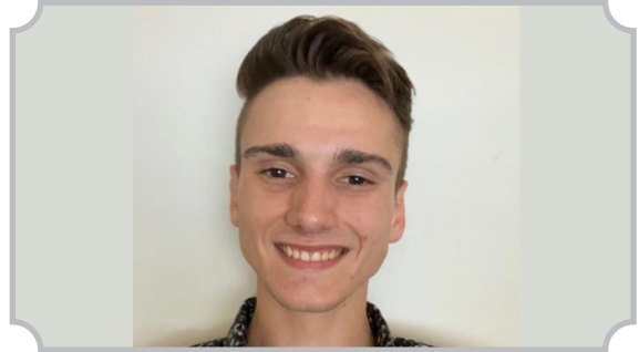
IRSC - EMT William C. Holmberg Award for Technical Education