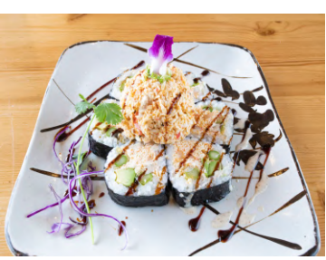
Spicy Lobster Roll 🌶️