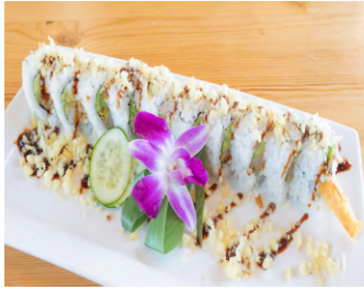
Crunchy Roll 🌸