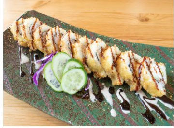
Crazy Boy Roll 🌶️ 🌸