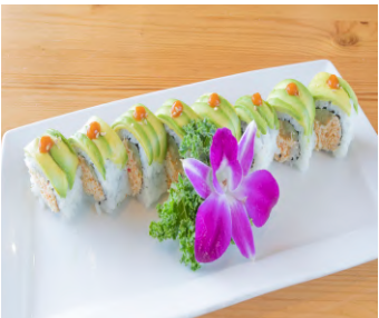
Mexican Roll 🌶️ 🌸