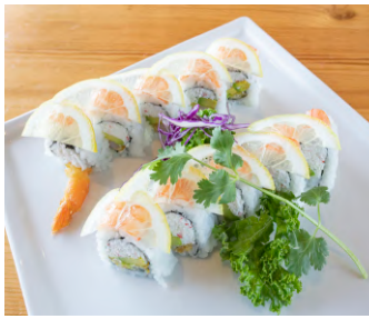
Double Shrimp Roll 🌸