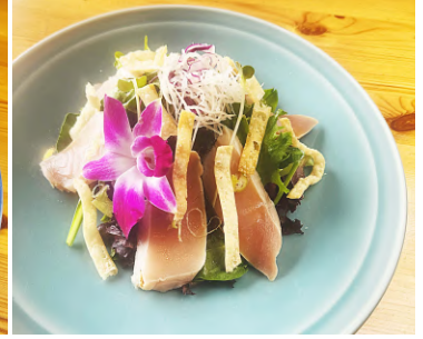
Seared Albacore Salad