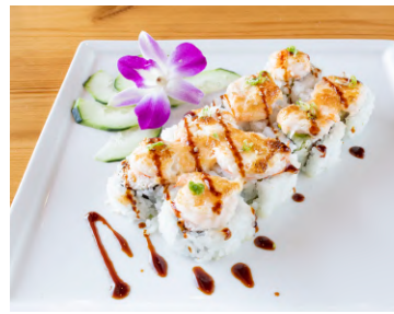
GSC Roll 🌸