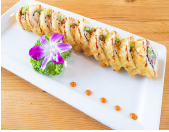
Caliente Roll 🌶️ 🌸