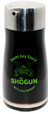
SHOGUN ORIGINAL Naturally Brewed Sushi Soy Sauce 40% Less Sodium