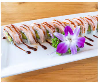
Seared Salmon Roll 🌸