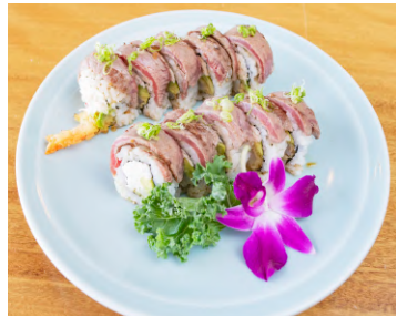
New York New York Roll