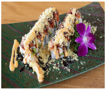
Crunchy Dragon Roll 🌶️ 🌸