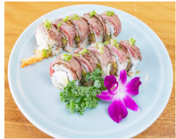
New York New York Roll