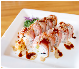
BBQ Roll 🌸