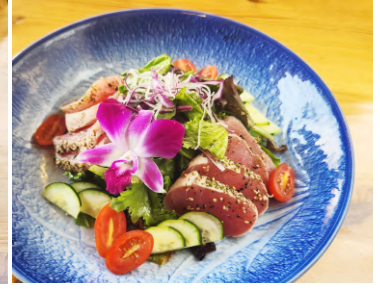
Seared Tuna Salad