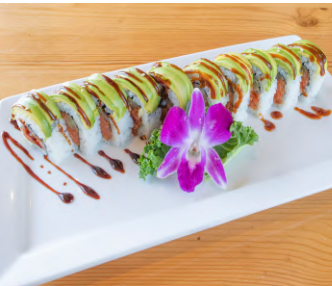
Kamikaze Roll 🌶️ 🌸