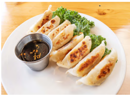
Gyoza (Pot Stickers)