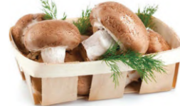
Cremeni Brown Mushrooms