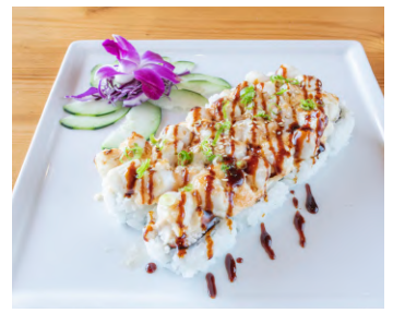
BSC Roll 🌸