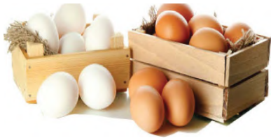
Cage Free Eggs