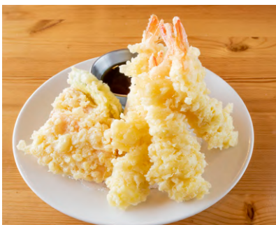
Shrimp & Vegetable Tempura