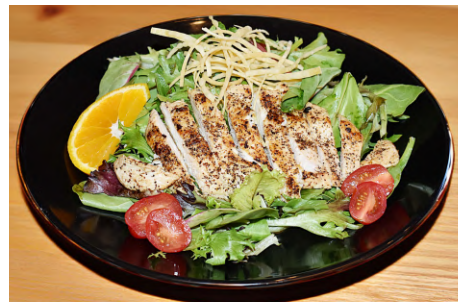
Grilled Chicken Salad

Tuna Yellowtail, Salmon and Albacore on a Bed of Gourmet Spring Mix. Served with Sesame Vinaigrette Dressing.