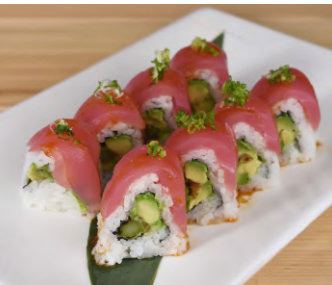
Red Dragon Roll 🌶️ 🌸