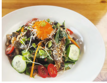
Salmon Skin Salad

Seared Tuna, Seasoned with Furikake, and Placed on Top of a Bed of Gourmet Spring Mix. Garnished with Tomato, Cucumber and Kaiware Radish. Finished with Sesame Vinaigrette Dressing.