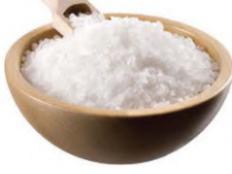
Natural Hawaiian Sea Salt