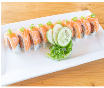
Alaskan Roll 🌶️ 🌸