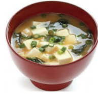
Organic Soybean Miso Soup