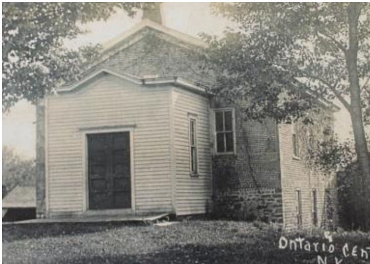
1840 Cobblestone building, about 1900