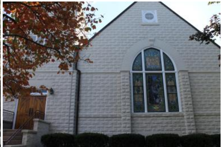
Current building in 2013