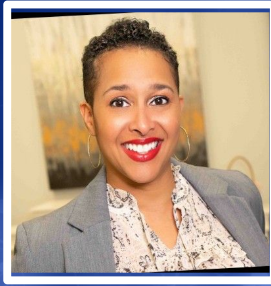
Future Cain CEO of Future of SEL