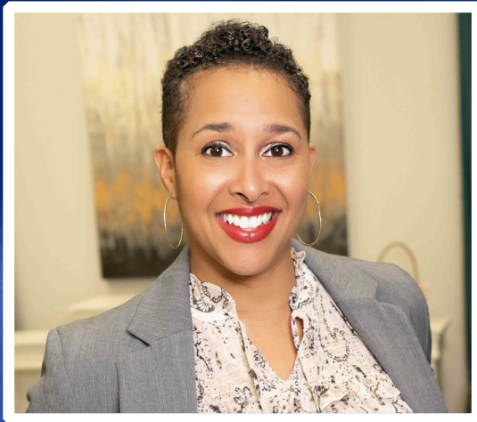
Future Cain CEO of Future of SEL