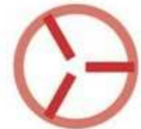
Michigan Educational Research Information Triad