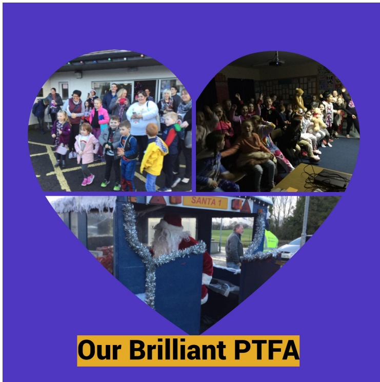
Our Brilliant PTFA

The PTFA is currently planning events once again and all parents are welcome to join this group if they so wish and we would be delighted to see you. In the past our PFTA was very active organizing Movie Nights, Santa Sundays and Summer Fairs. As a result they supplied the school with our Accelerated Reading Programme, four new laptops and it continues to support our After-School Provision, as well as Relax Kids.