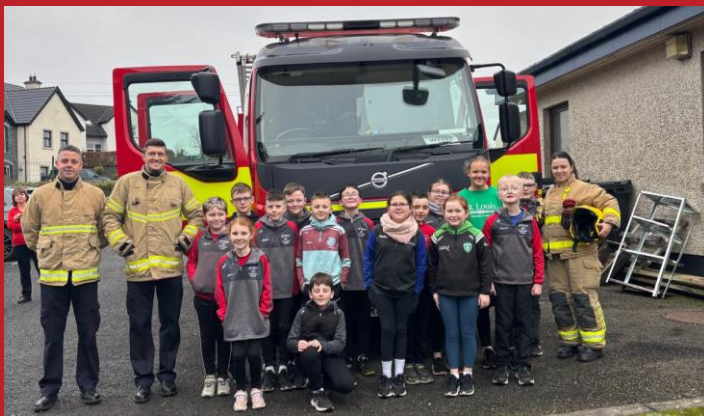
P6/7 made clay boats and tested if they floated in World Around Us with Miss Kirk.