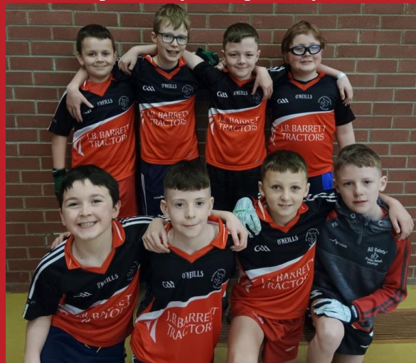
The P6/7 boys who took part in the Ronnie Kelly Gaelic tournament. They came runners up in the shield!