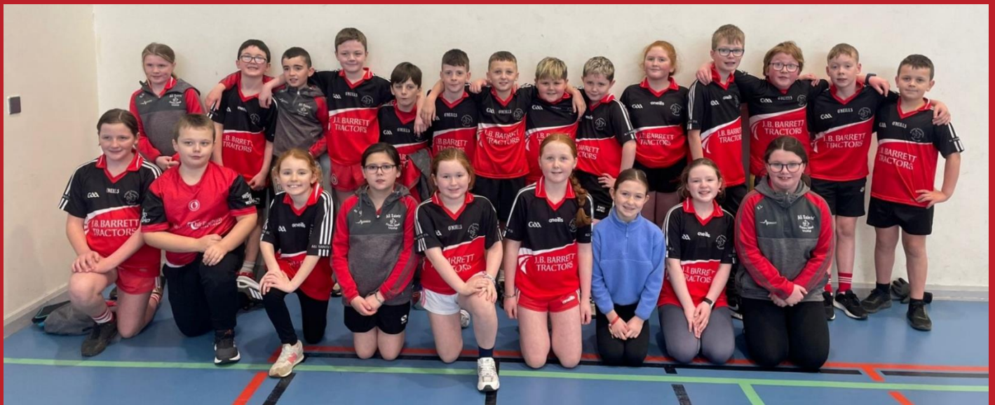
P6/7 attended an indoor Gaelic blitz in Dromore