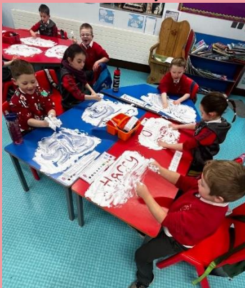
Hands on (and messy fun) learning!

The children's topic was rhyme time and Christmas toys.