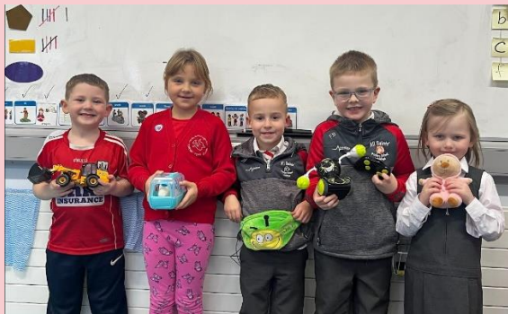
Show and tell