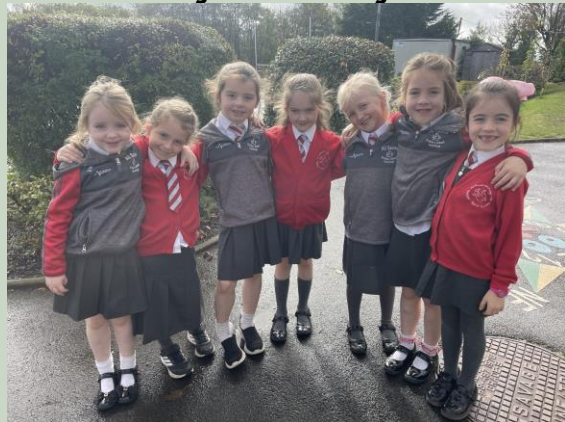
Having fun outside together