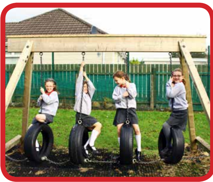
Children enjoying outdoor play