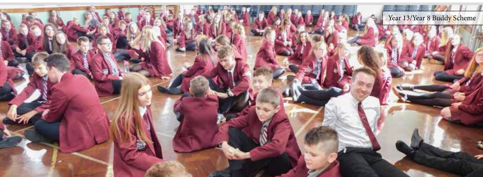
Year 13/Year 8 Buddy Scheme