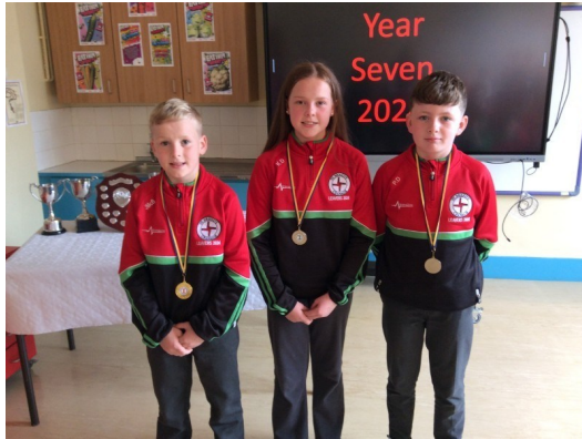
Prize Giving 2024