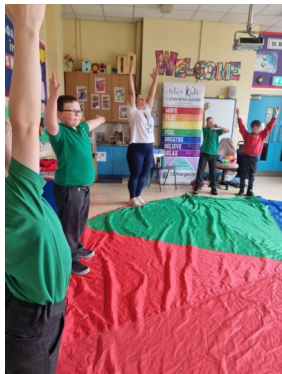
Relax Kids Workshop

Our pastoral dimension permeates all aspects of school life. It involves all members of our school community - pupils, staff - teaching and non-teaching, parents, chaplain, governors and all adults involved in contributing to the well being of our children. It also involves members of the wider community of the parish, other schools, and outside agencies with whom we come in contact.