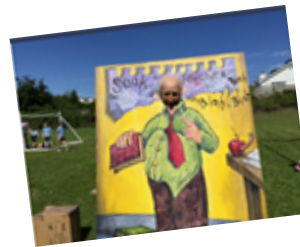
2022 Fun Day

With your continued support, £7,973.73 was raised during the 2021/2022 year. The PSG spent £6,728.88 and funded: