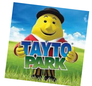
Contribution to P7 Leavers Trip