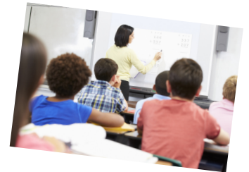
Four interactive whiteboards