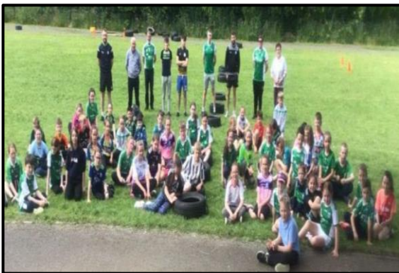
Roslea GFC Coaching Day

We see our school as a central part of the local community and we are proud of the strong links we have nurtured with local businesses, Roslea Shamrock's GFC, St. Tierney's Church, neighbouring primary and post primary schools and indeed the wider community. By working together to give our pupils the best opportunities and experiences, we enable them to grow and develop life skills and find their place as valuable members of society.