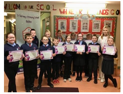
Digital Leaders for 24/25