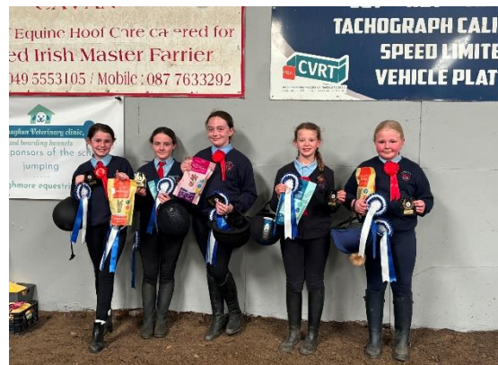
Mullaghmore Equestrian Schools League