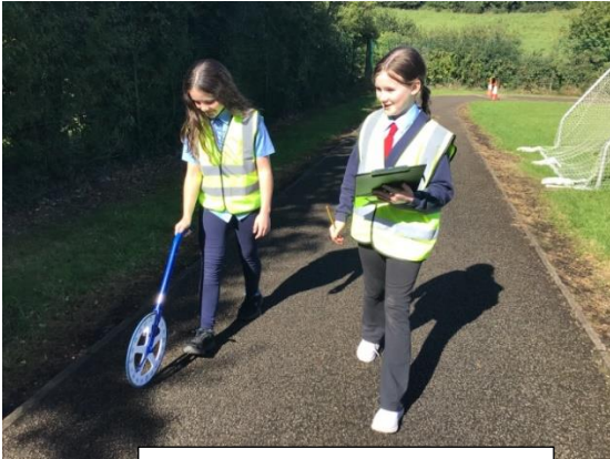
Outdoor Maths Work

Learning will be a source of pleasure; this can be achieved through work of a practical nature. Practical work includes Drama in Literacy, RE, PDMU etc; practical work and experiments in Numeracy, World Around Us and Activity Based Learning.