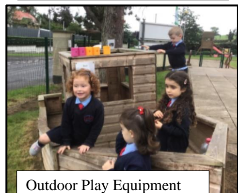
Outdoor Play Equipment