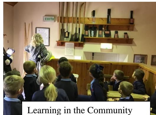
Learning in the Community