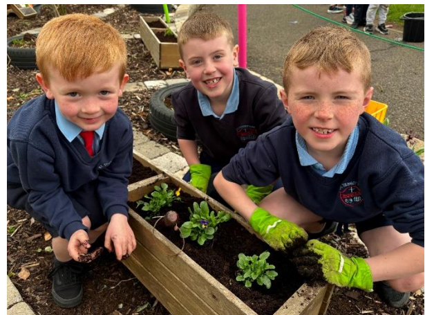
Planting in our Eco-Garden