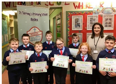
School Council for 24/25