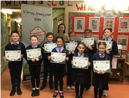
Eco Council for 24/25

By promoting the Voice of the Child we are happy that in our school we are helping to build confidence and prepare young people for roles in society.