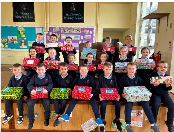
Team Hope Shoe Box Appeal

St. Tierney's Primary School has strong links with Roslea Cross Community Play Group and continues to develop a learning community with its neighbouring primary schools and post-primary schools and with the many groups and associations within the Roslea community and the surrounding areas. As a school community, we are committed to building relationships at all levels. This partnership consists of the Board of Governors, the staff, the pupils and parents all working together to ensure that our children receive the best education possible. The ethos of the school is experienced through the warm welcome given to all. All contributions are valued, whether from pupils, parents, staff, governors, external agencies or other stakeholders and we are committed to a process of self-evaluation to ensure we continue to improve on our previous best.