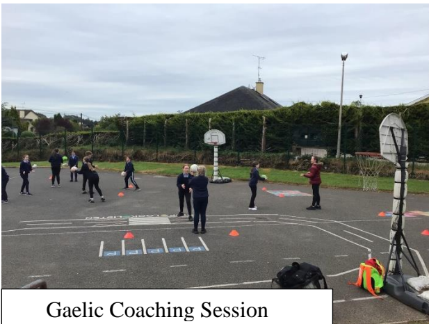
Gaelic Coaching Session