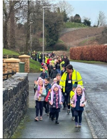
Sustrans Walk to School