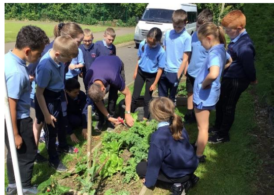
Working in the School Gardens