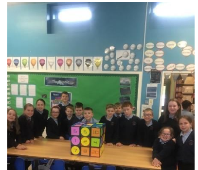
Active Learning in Numeracy