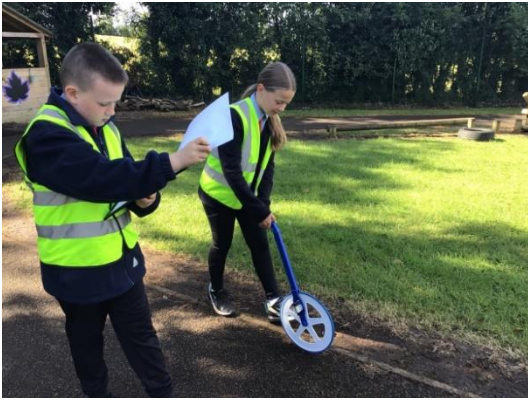
Outdoor Maths Problem Solving