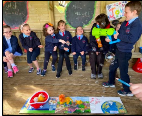
Story Time in our Outdoor Classroom

Pupils are offered a range of extra-curricular activities, either within the school day or after school through our popular Extended Schools Clubs. Activities on offer include; Gaelic football, camogie/hurling, tin whistle, fiddle, choir, art, games, drama, cooking, athletics, sports, ICT, cycling proficiency, gardening and much more.