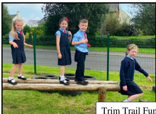
Trim Trail Fun and Agility Sessions