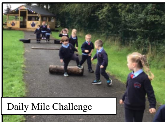
Daily Mile Challenge