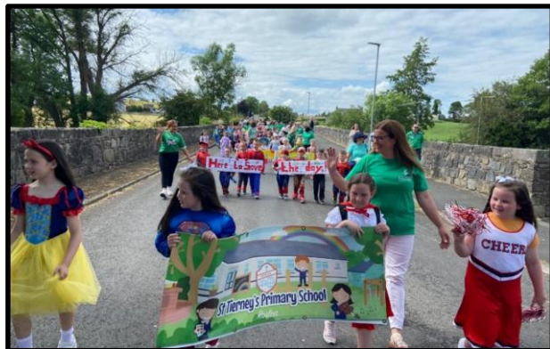
Leading the parade at Fermanagh Fleadh