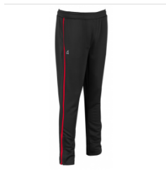
AKOA Pro Track Pants