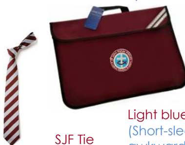
SJF Tie (Elastic, clip-on or normal)

SJF Book Bag (for younger children, stores more easily than a rucksack)