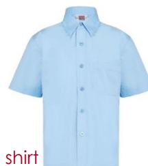
Light blue shirt (Short-sleeved avoids awkward cuff buttons)