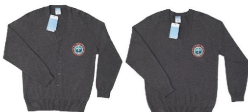
Dark grey cardigan or jumper

SJF Book Bag (for younger children, stores more easily than a rucksack)