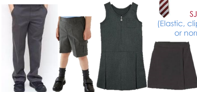
Dark grey trousers, mid-length shorts, pinafore dress or skirt (To be worn with dark grey socks or tights)