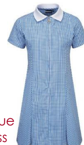
Light blue gingham dress (Optional in Terms 1, 5 and 6 only and to be worn with white socks)