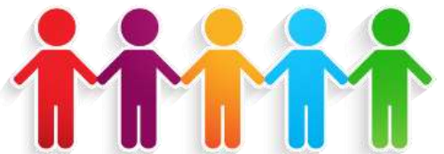
Primary Languages Network