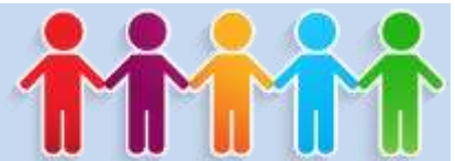
Primary Languages Network