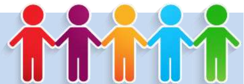
Primary Languages Network