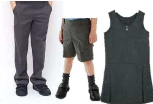
Dark grey trousers, mid-length shorts, pinafore dress or skirt (To be worn with dark grey socks or tights)