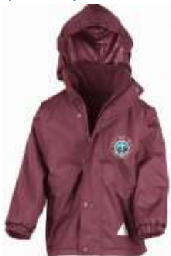
SJF Coat (Optional)