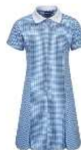
Light blue gingham dress

(Optional in Terms 1/5/6 only and to be worn with white socks)