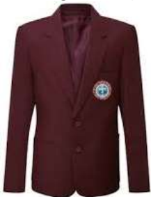
SJF Blazer (Optional)