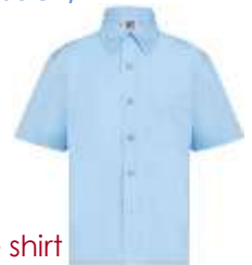
Light blue shirt (Short-sleeved avoids awkward cuff buttons)