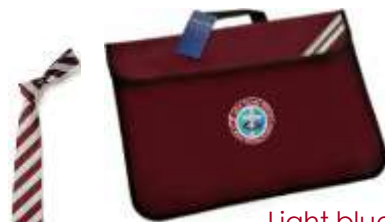
SJF Tie (Elastic or normal)