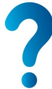
Interested? Please contact us.