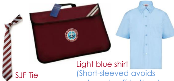
SJF Tie (Elastic or normal)