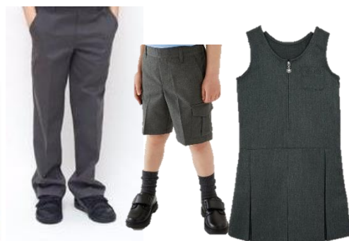
Dark grey trousers, mid-length shorts, pinafore dress or skirt (To be worn with dark grey socks or tights)