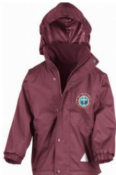
SJF Coat (Optional)