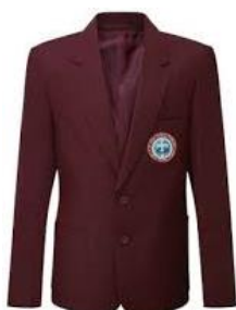
SJF Blazer (Optional)