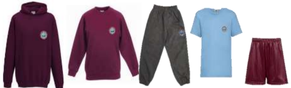
Official PE uniform with logo or plain in the correct colours. No designer labels and no leggings.