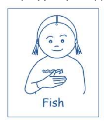
Flat hand wiggles across body.