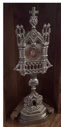
Relic of Blessed Carlo Acutis in St Gerard's, Thrybergh

It is unusual to hear news of Saints on BBC Radio 4, so the coincidence of encountering the relic of Blessed Carlo Acutis at St Gerard's, Rotherham, who have custody of it, and then hearing on the national news that Pope Francis has formally recognised a miracle attributed to the intercession of of Blessed Carlo was a pleasant surprise. The cause for his canonisation can be seen at carloacutis.com , which tells something of his story.