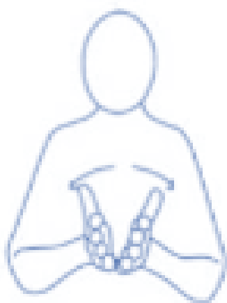
Once upon a time

Please click here to view 'The Singing Hands' video which also shares the signs for different breakfast choices, including porridge. In class we have been talking about how important it is for our bodies to eat a healthy breakfast at the start of every day.