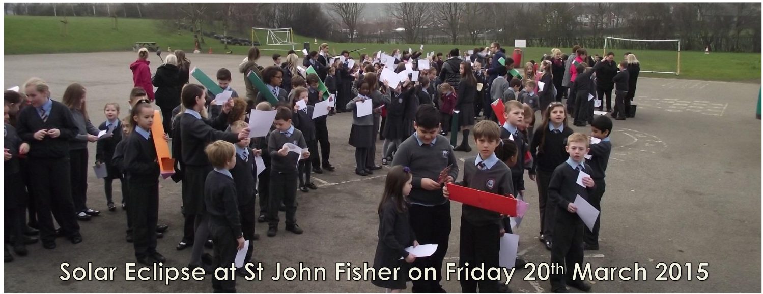
Solar Eclipse at St John Fisher on Friday 20 th March 2015