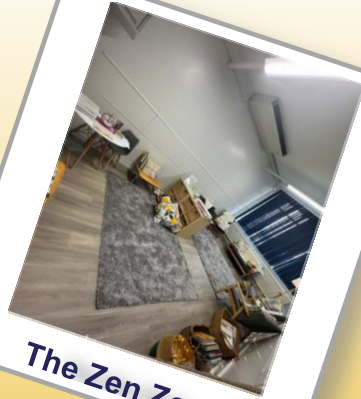
The Zen Zone

We are all super proud of our recent Inclusion Quality Mark, Centre of Excellence Award