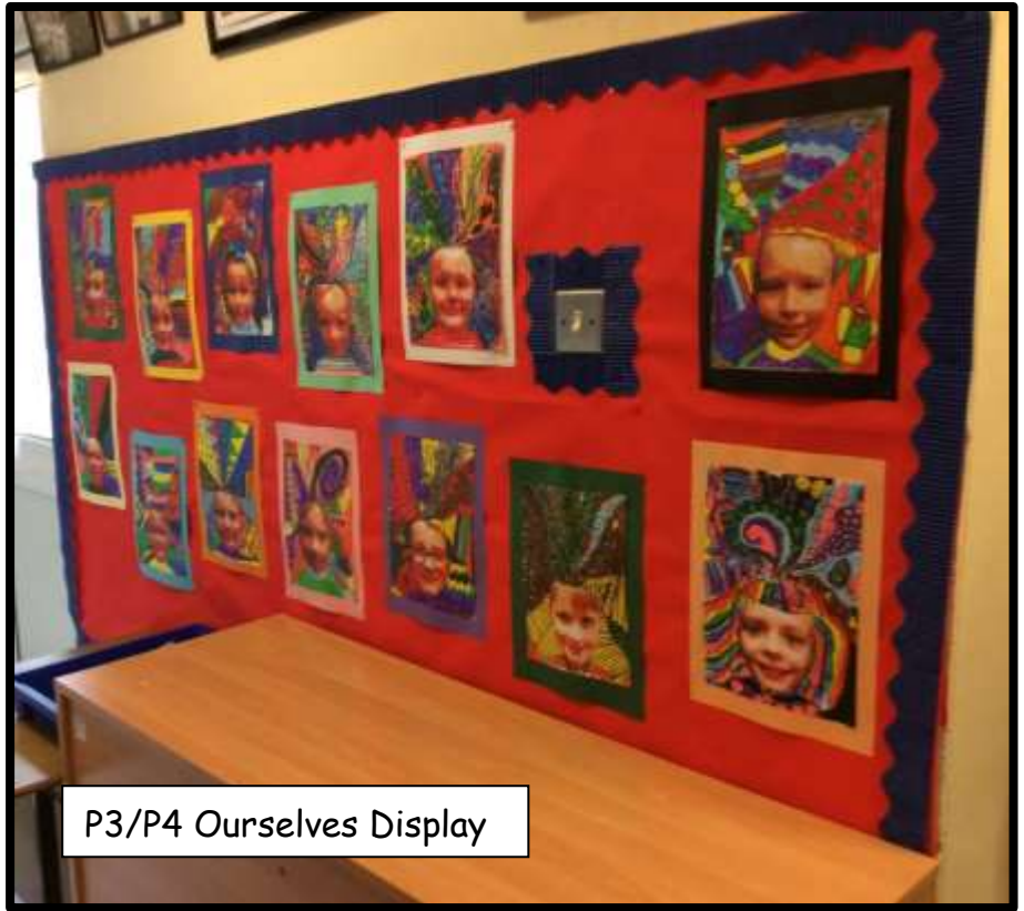
P3/P4 Ourselves Display