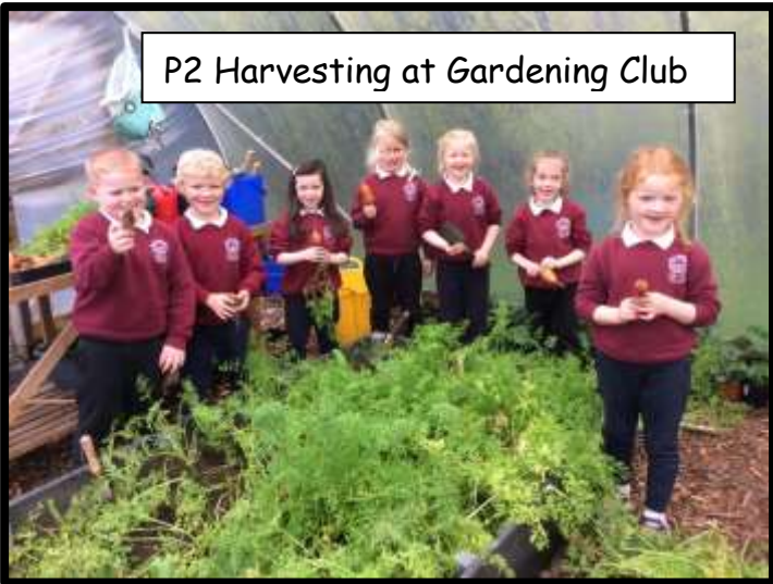
P2 Harvesting at Gardening Club