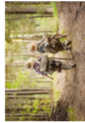
Reception. Spring 1