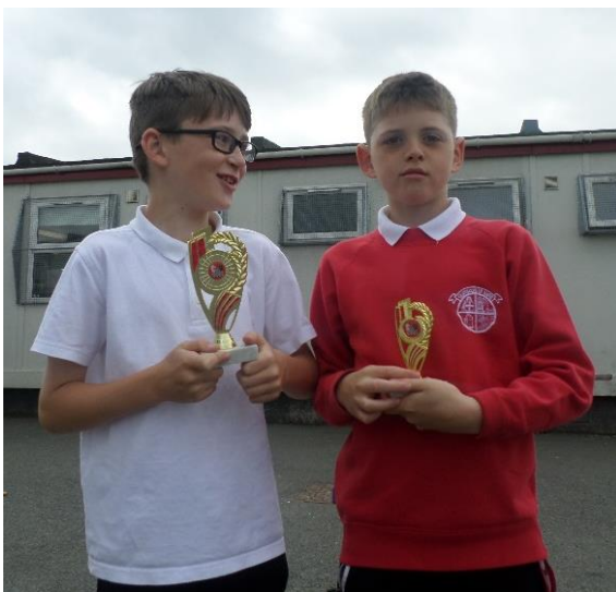
Cairde Fichille Chess Mates

A very proud sportsman Fear spóirt an-bhródúil