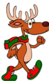
Gailéaraí / Gallery