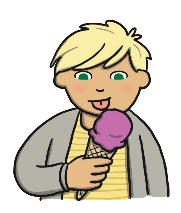
I can taste with my tongue.