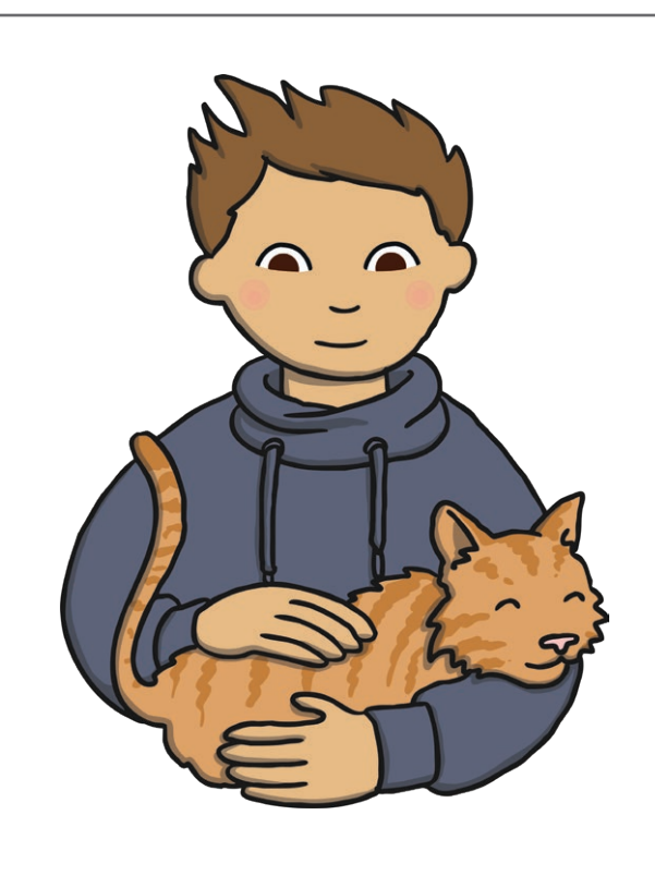
I can touch with my hands.