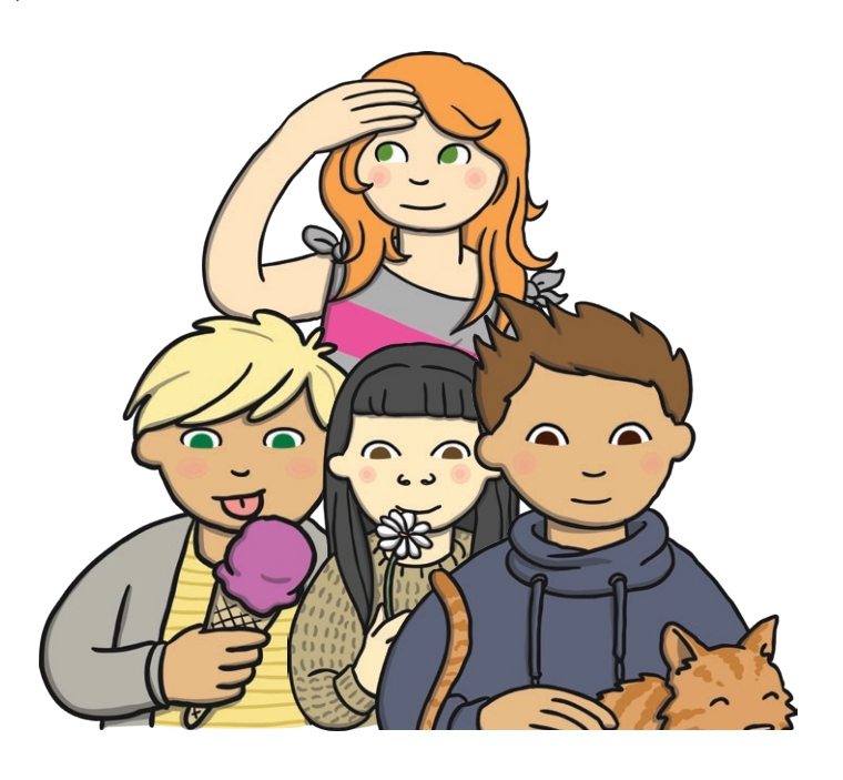
Which senses are you using right now?