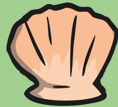
a shell from a mermaid