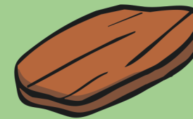
a scale from a dragon