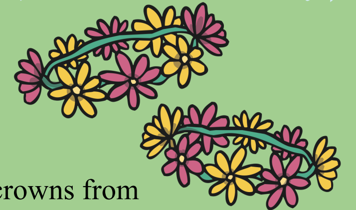
crowns from a fairy queen