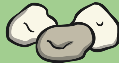
space rocks from the Moon