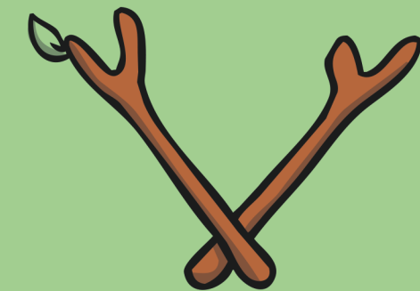
wands from a wizard