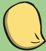
a golden coin from a pirate ship