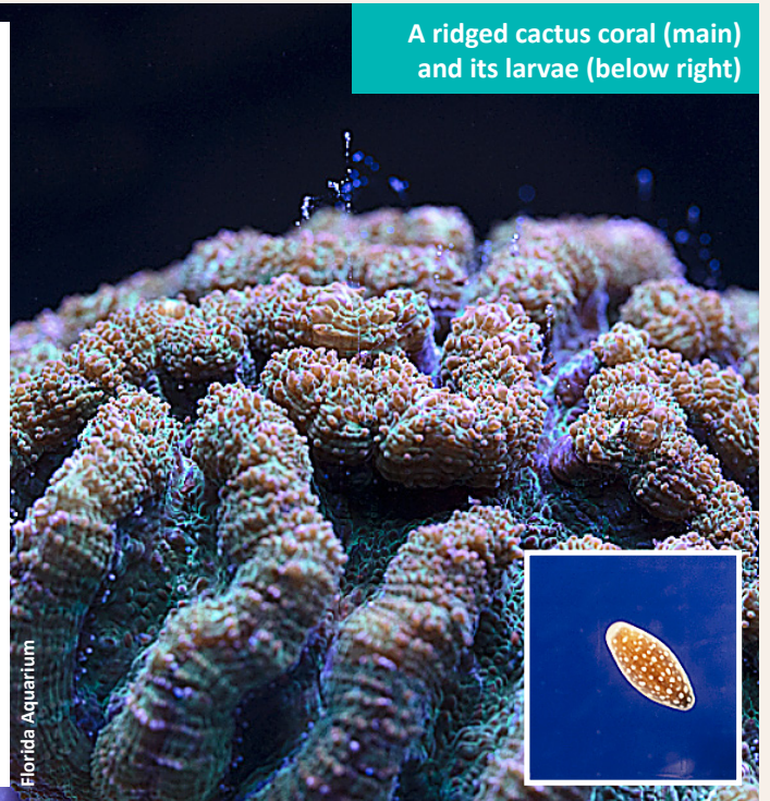
A ridged cactus coral (main) and its larvae (below right)

The work is part of a collaboration between the Florida Fish and Wildlife Conservation Commission and the National Oceanic and Atmospheric Administration’s National Marine Fisheries Service, which aims to save the Florida Reef Tract from extinction. The Florida Reef Tract spreads across 270km, but is under threat, just like many coral reefs around the world.