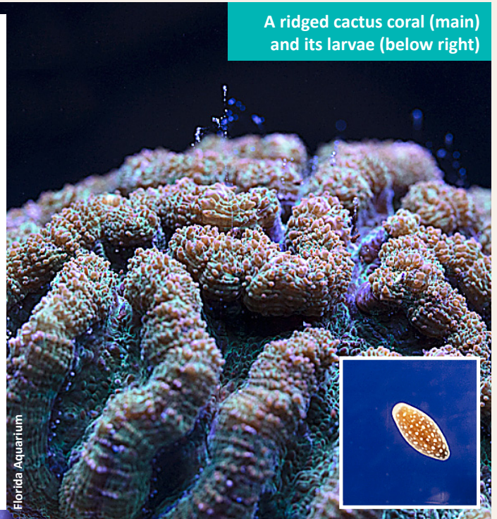
A ridged cactus coral (main) and its larvae (below right)

The work is part of a collaboration between the Florida Fish and Wildlife Conservation Commission and the National Oceanic and Atmospheric Administration’s National Marine Fisheries Service, which aims to save the Florida Reef Tract from extinction. The Florida Reef Tract spreads across 270km but is under threat, just like many coral reefs around the world.