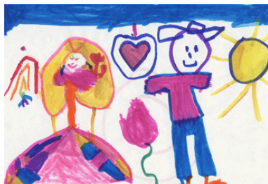
my mum and dad